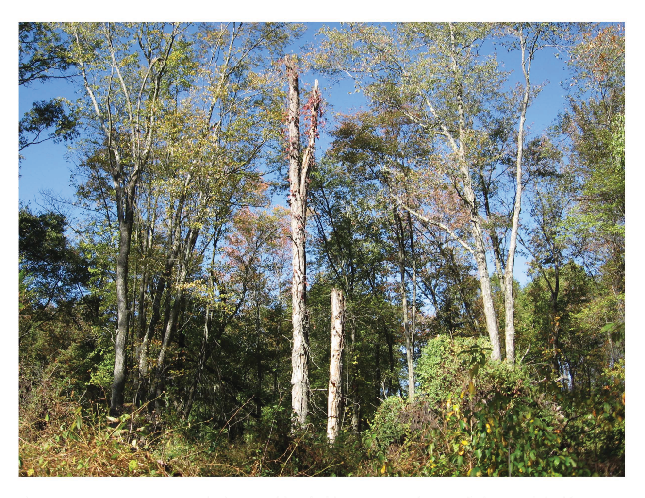
Photo 4. Forest Area 9 – Typical snag with suitable roost tree characteristics. Stub lacking suitable roost tree characteristics is visible to the right.