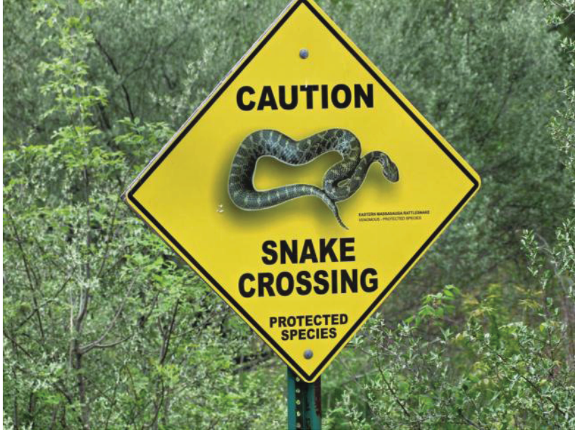
Figure 1. Sample snake crossing sign to be used in construction areas.