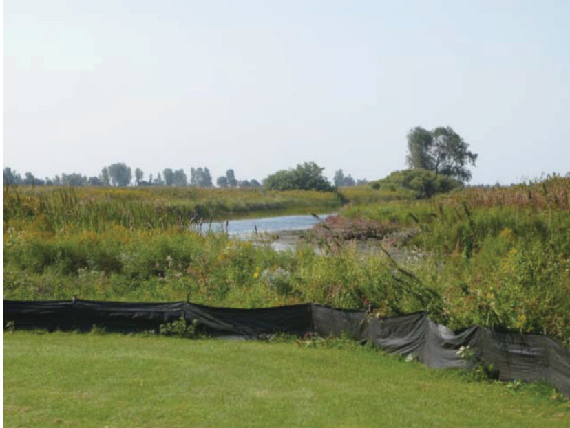
Figure 2. Temporary snake barrier fence.