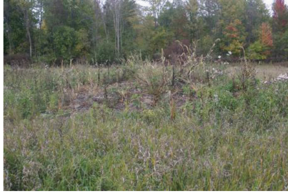
Figure 4. Completed hibernacula.