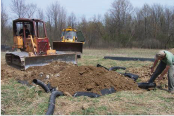
Figure 3. Placement of fill material.