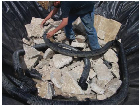
Figure 2. Placement of structural layers.