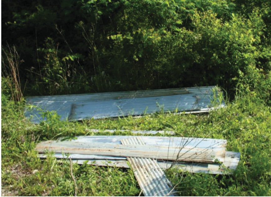
Figure 4. Artificial cover objects used to attract snakes for collection.