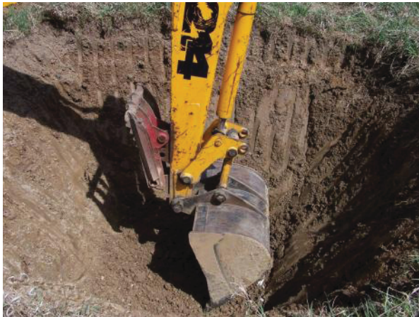
Figure 1. Excavation of hibernacula pit.

Once complete, barrier fence (tall silt fence) will be installed around the hibernacula and adjacent habitat to help facilitate soft release and acclimation of fox snakes to the release site. Periodic maintenance, such as removal of excess vegetation and clearing of debris will be performed, as needed. Fence will be maintained for a minimum of three to five years in some capacity while acclimating eastern fox snakes to the new habitat.