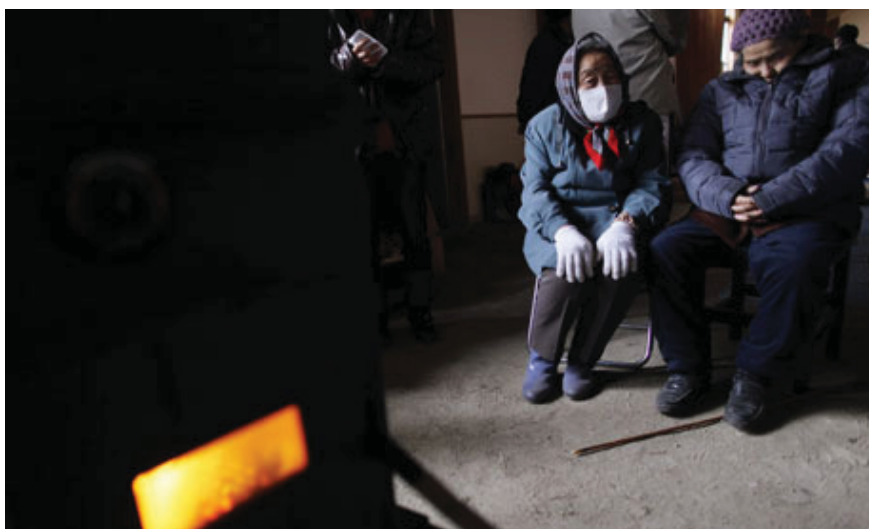
An elderly couple sit near a woodburning stove in agymnasium being used to house those displaced by the Japanese earthquake and tsunami in town of Otsuchi