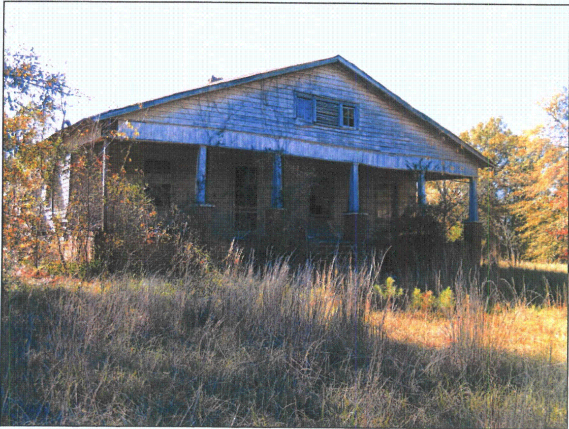
Figure 52. 51160, view southwest.