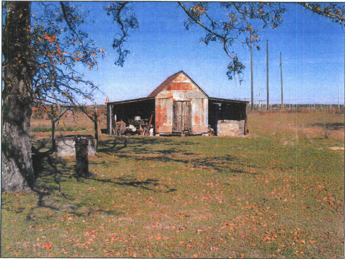
Figure 44. 51122, outbuilding 1 and wellhead, view north-northeast.