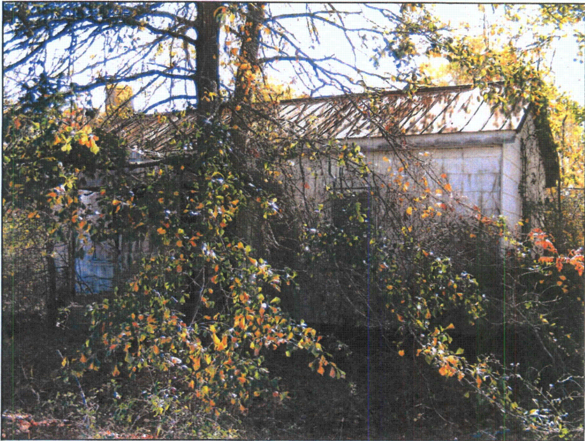
Figure 47. 51161, view southeast.