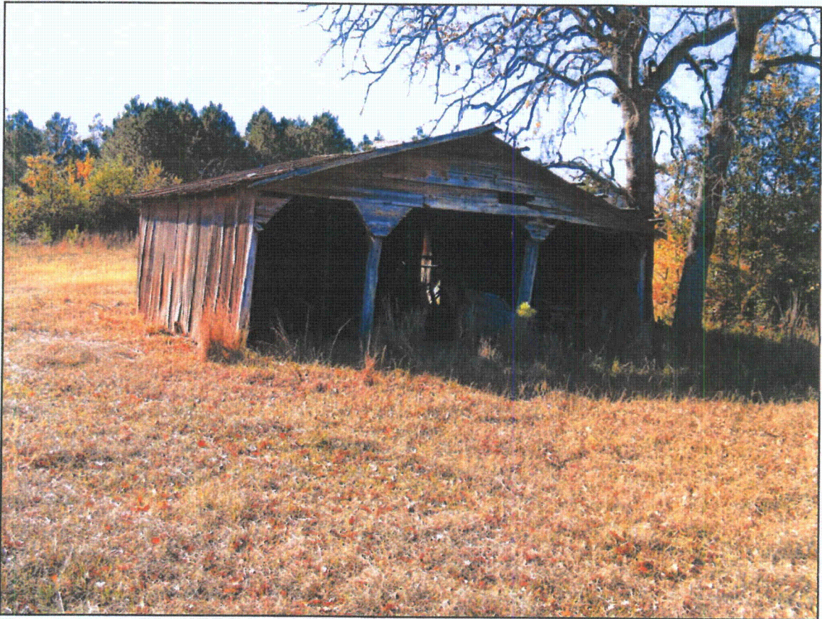
Figure 55. 51160, barn 1, view southwest.