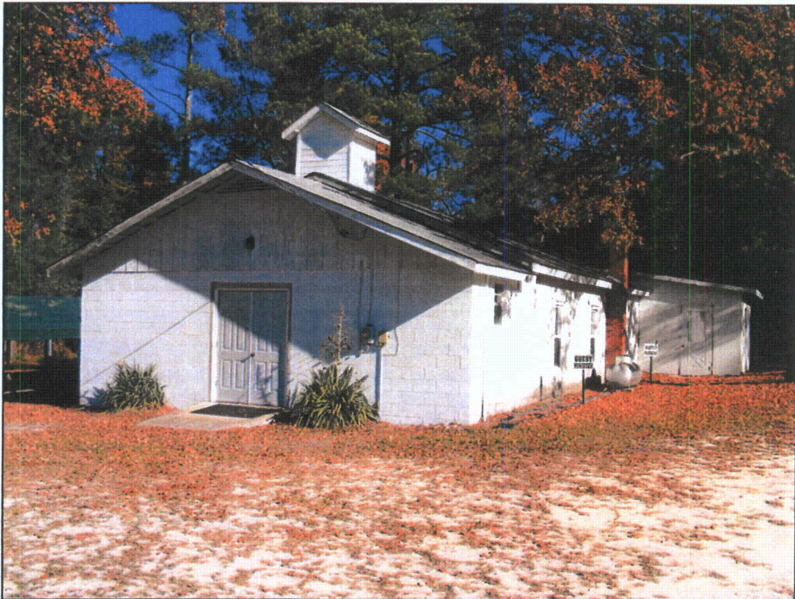
Figure 49. 237406, church associated with the Mount Gilead Baptist Cemetery, view north. Thomson-Vogtle Cultural Resource Survey