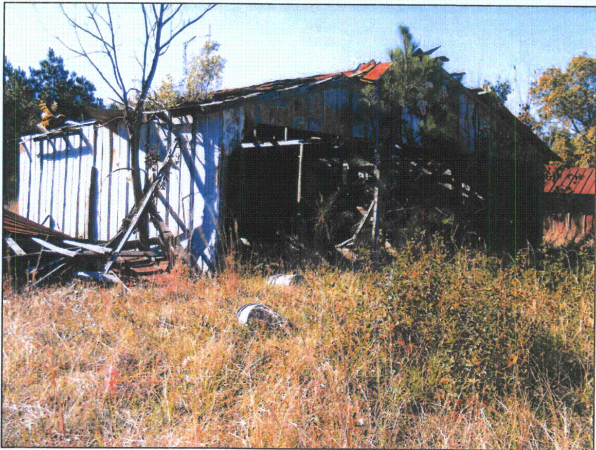
Figure 56. 51160, barn 2, view southwest.