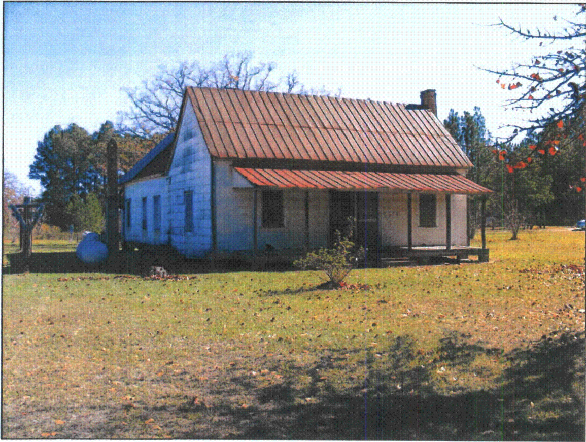
Figure 42. 51122, view southeast.