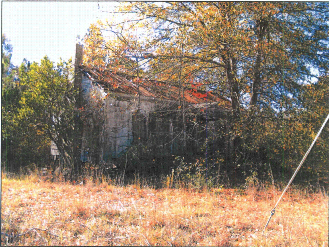
Figure 46. 51161, view southwest.