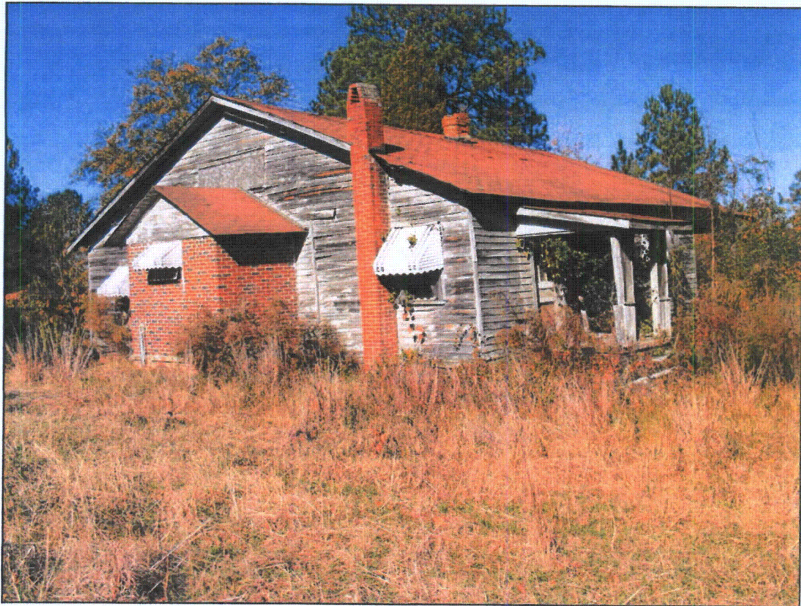
Figure 53. 51160, view northwest.