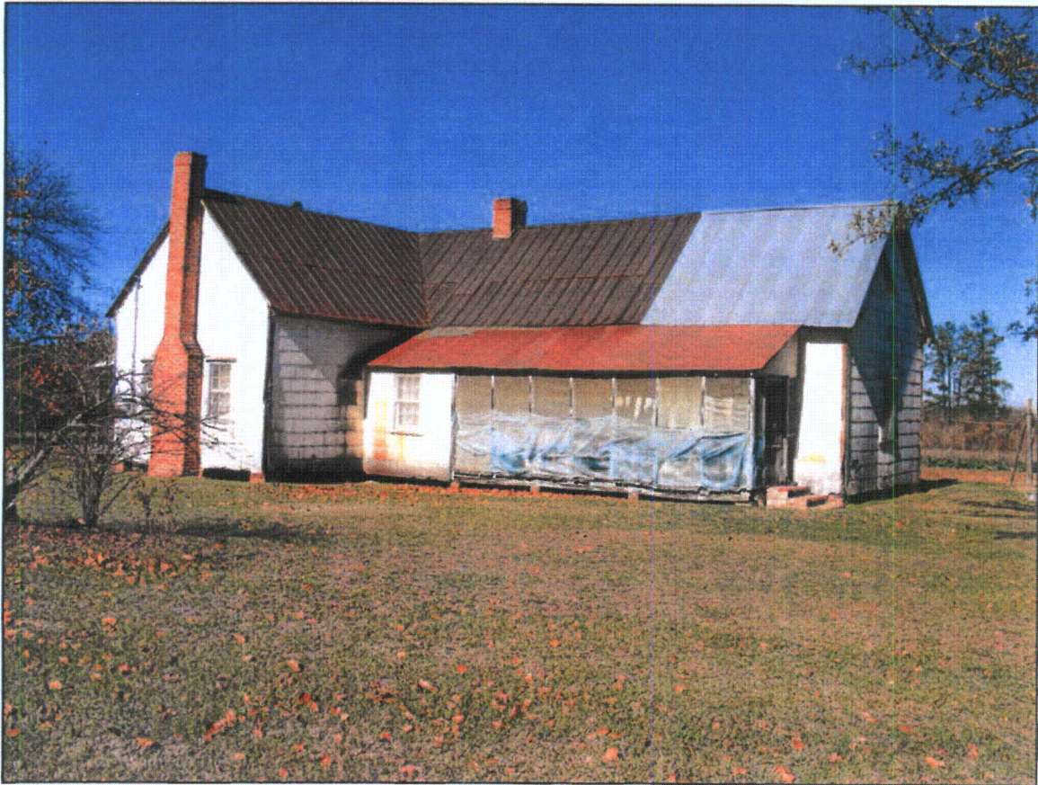
Figure 43. 51122, view northwest.