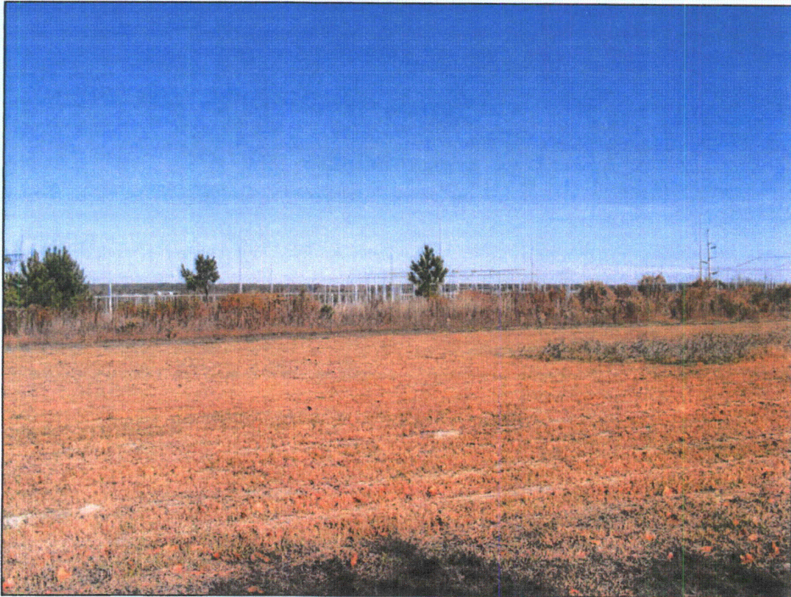
Figure 45. 51122, view to project area, northeast.