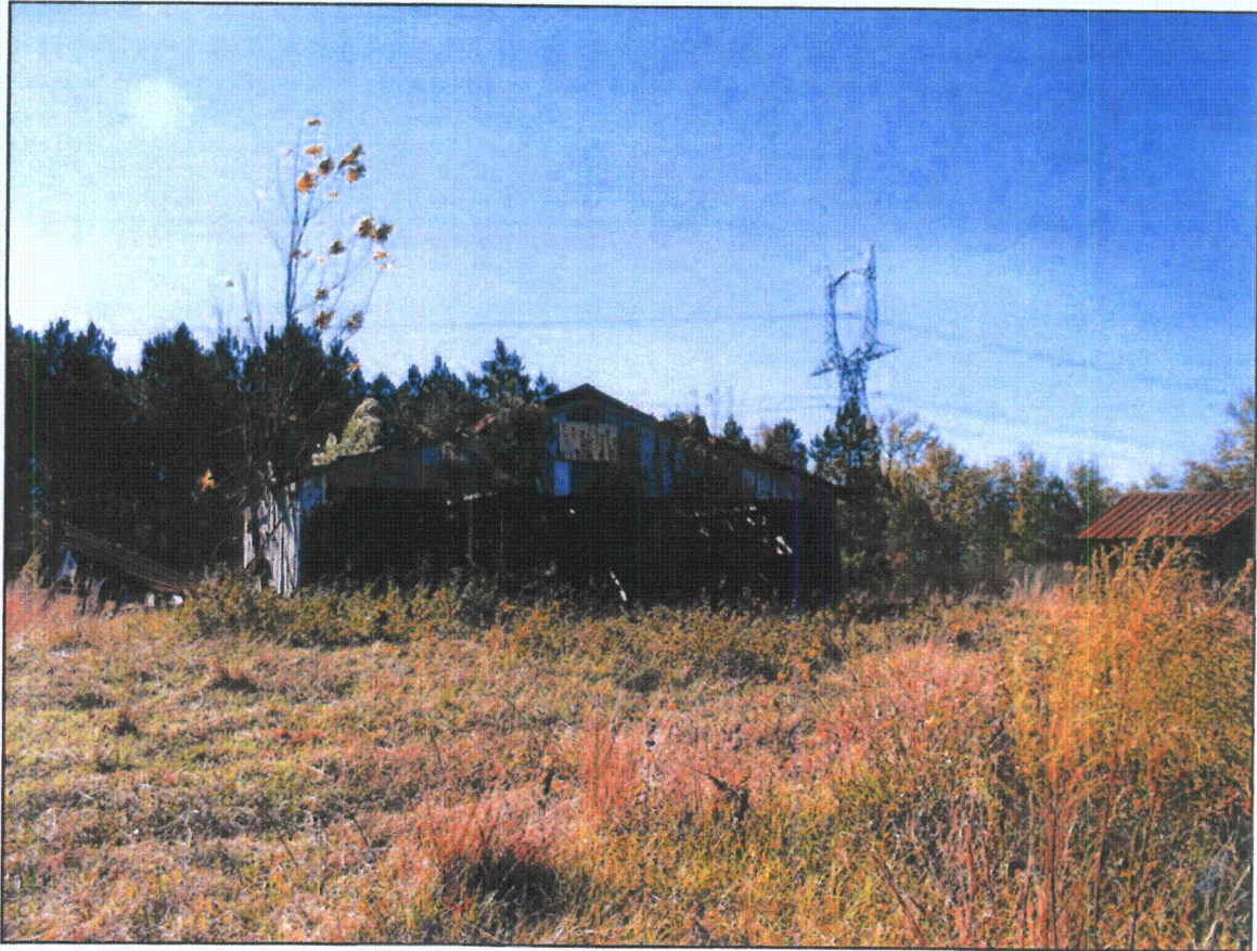
Figure 58. 51160, view to project area, northwest.