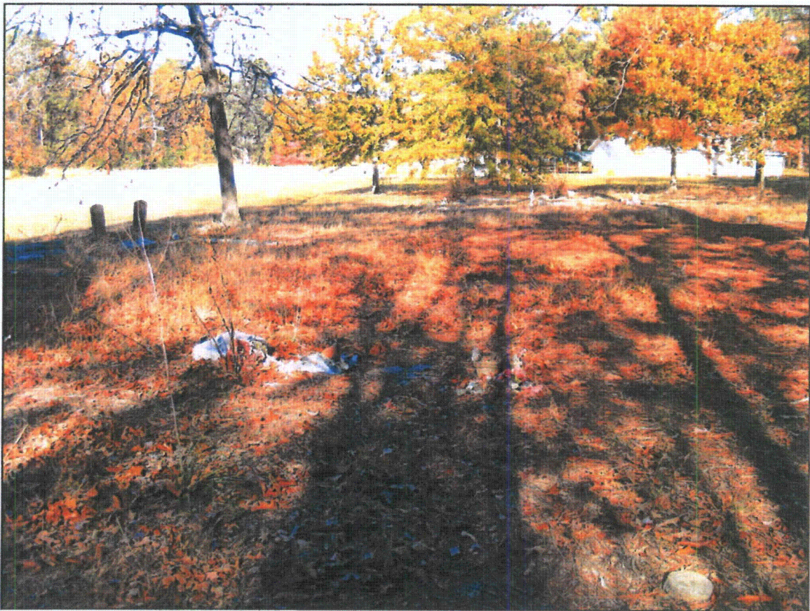
Figure 50. 237401, cemetery at Mount Gilead Baptist Church, view northwest.