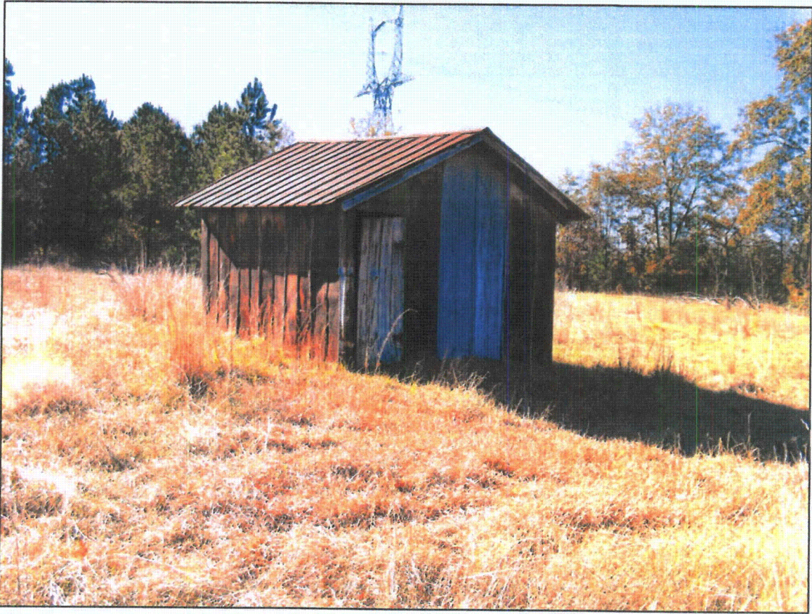
Figure 57. 51160, smokehouse, view southwest.