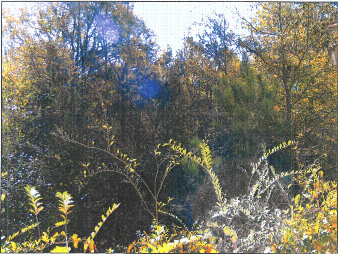
Figure 48. 51161, view to project area, south.