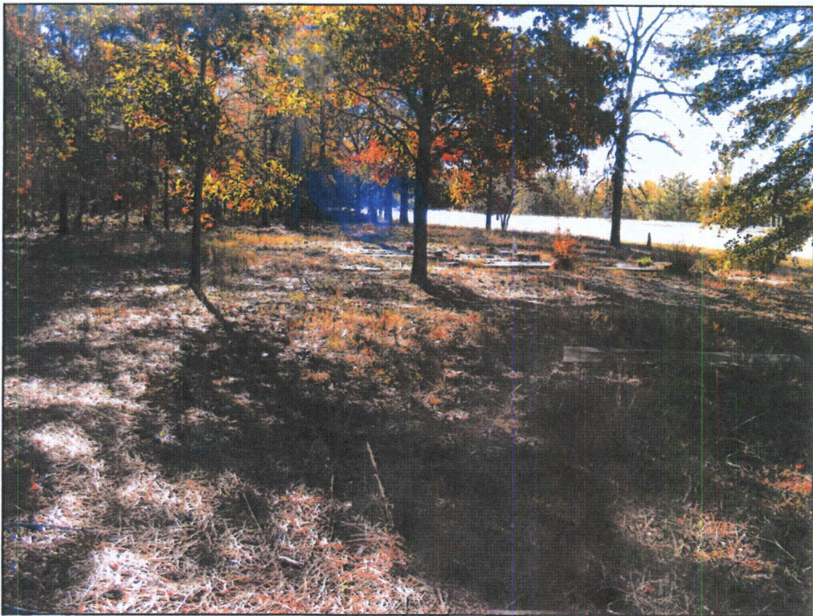
Figure 51. 237401, cemetery at Mount Gilead Baptist Church, view south.