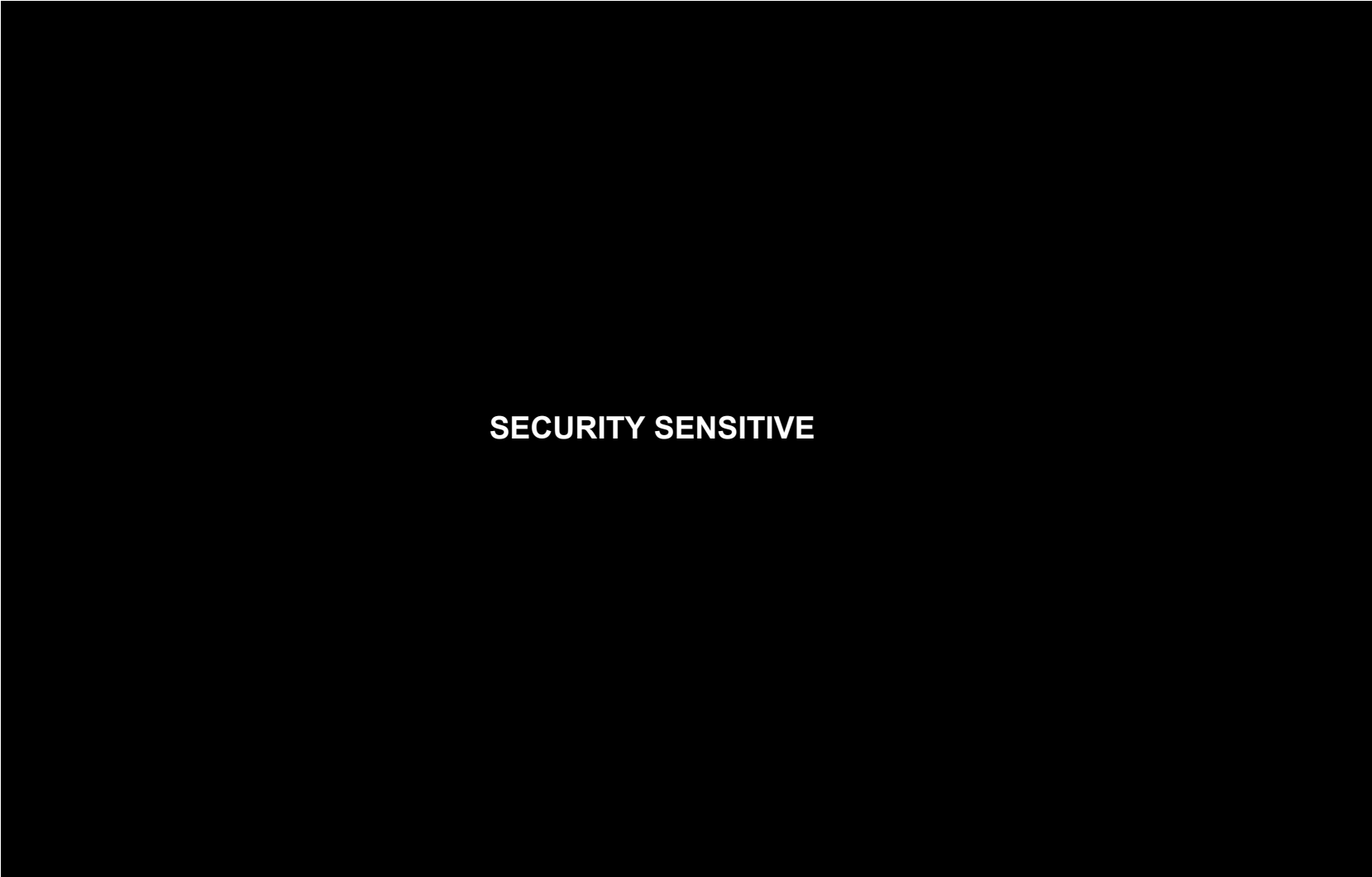
Figure 3.2p Control Building Radiation Zone Map for Full Power Operations, Section B-B