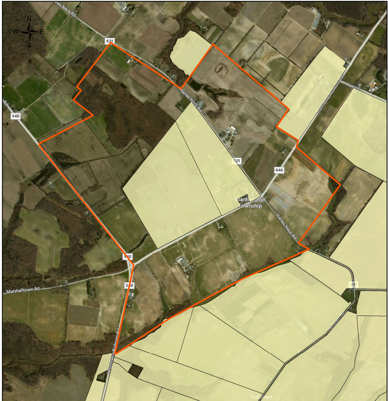
Figure ESP EIS 2.2-5-1 Alternative Site 7-1 Farmland Preservation Land