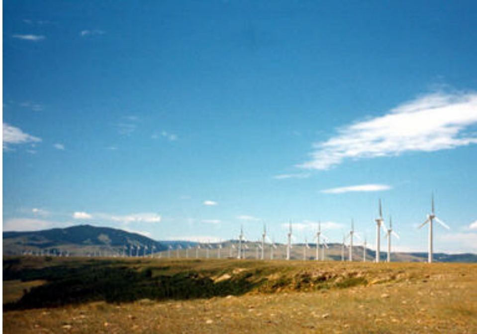
FIGURE 5.11-1 View of the Wyoming Wind Project near Arlington, Wyoming