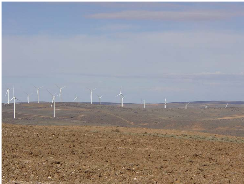
FIGURE 5.11-2 View of a Wind Energy Development Project near Evanston, Wyoming