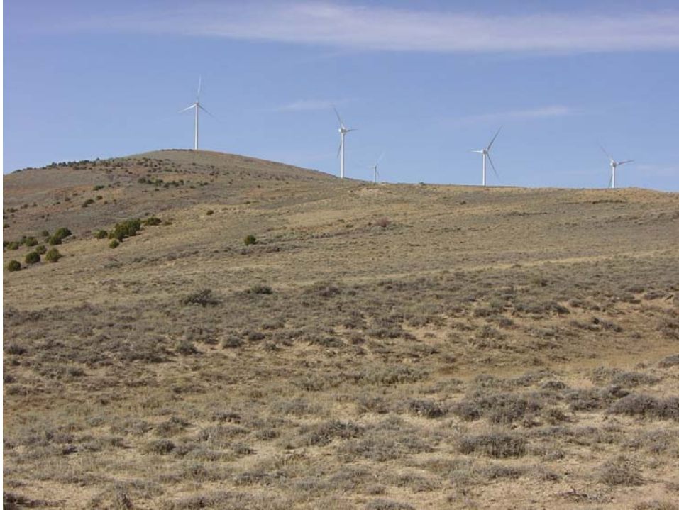
FIGURE 5.11-3 Another View of a Wind Energy Development Project near Evanston, Wyoming

but less severe effect would be a sun-dial-like effect, also increased at low sun angles, as the shadows of very tall turbines sweep great distances over the landscape. Interposition of turbines between observers and the sun may also produce a strobe-like effect caused by the regular reflection of the sun off rotating turbine blades. Unlike shadow flicker, perception of blade glint would depend on the orientation of the nacelle, angle of the rotor, and the location of the observer relative to the position of the sun. Blade glint would also be influenced by the color, reflectivity, and age of the blades. This effect may be noticeable at distances of about 6.2 to 9.3 mi (10 to 15 km) and may be especially pronounced when aligned with roadways or other viewing corridors.