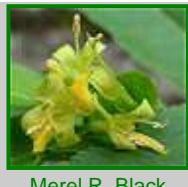
Merel R. Black