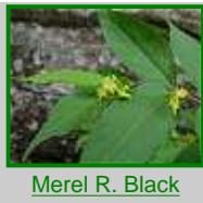
Merel R. Black