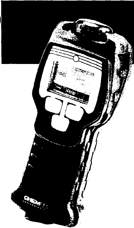
Figure 1: ChemPro 100 or 100i