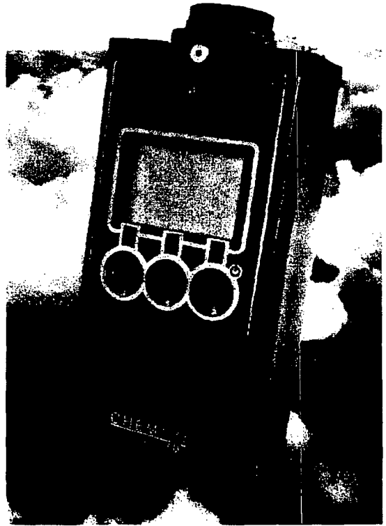
Figure 2: ChemPro PD