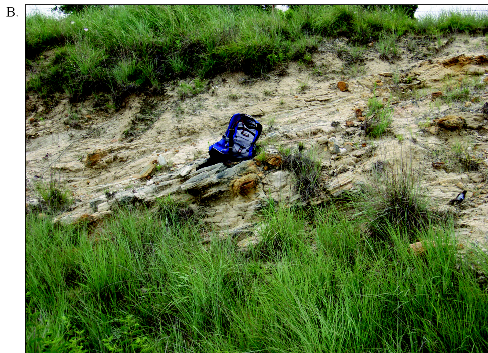
Field photos of (A) typical bedding in the Paluxy Formation and (B) more steeply dipping bedding associated with feature along Highway 56