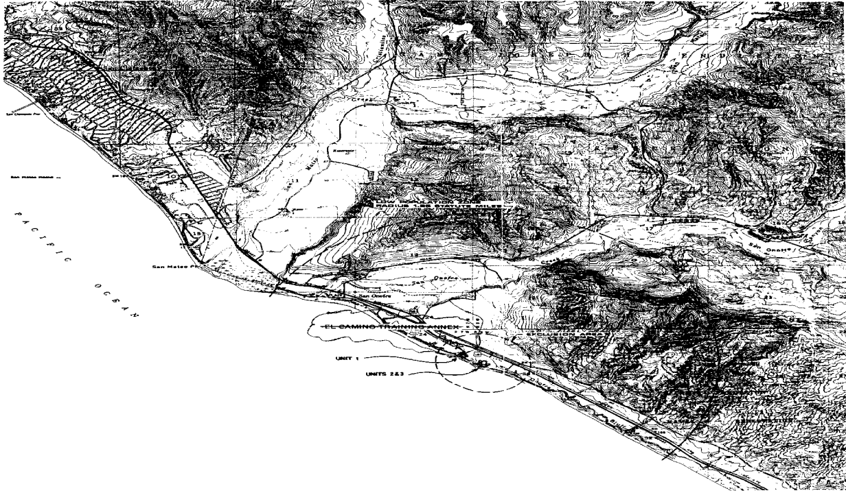
SAN ONOFRE NUCLEAR GENERATING STATION Unit 1 Defueled Safety Analysis Report Low Population Zone Figure 2-4