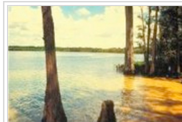
Many clearwater lakes are found in region 65-03, and a few clearwater lakes, such as Lake Cassidy, occur in 65-02.