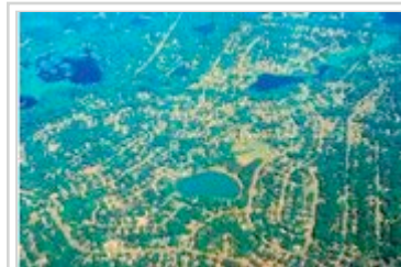
Lake conditions vary in this suburbanized residential area north of Tallahassee, region 65-04.