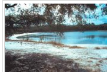
White quartz sand surrounds crystal-clear Sheelar Lake and other acidic lakes in the Trail Ridge region, 75-04.