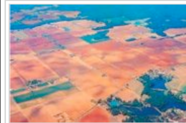
Small ponds and reservoirs on red sandy soils are typical in region 65-01.

76-04. The Southern Coast and Islands region includes the Ten Thousand Islands and Cape Sable, the islands of Florida Bay, and the Florida Keys. It is an area of mangrove swamps and coastal marshes, coral reefs, various coastal strand type vegetation on beach ridge deposits and limestone rock islands. Although freshwater habitats are limited or non-existent in this region, any freshwater that does occur for periods of time may have great ecological significance. Coastal rockland lakes are small in size and number, occurring primarily in the Florida Keys. These waters are alkaline, with high mineral content and highly variable salinity levels. The rockland lakes provide important habitat for several kinds of fish, mammals, and birds of the Keys. Reductions in the fresh groundwater lens that floats on the denser saline groundwater can severely affect these lakes.