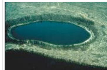
Clearcut logging around Lake Five-0 in region 65-03.

75-01. Several types of [[freshwater biomes#ponds and lakes]] lakes occur in the Gulf Coast Lowlands lake region, including coastal dune lakes, flatwood lakes, "edge lakes", river floodplain or oxbow lakes (Dead Lake), and reservoirs (Deer Point Lake). Most of the lakes tend to be darkwater, acidic, softwater lakes with low to moderate nutrients. Coastal dune lakes have higher sulfate, sodium, and chloride levels than inland lakes, and can freshen or turn salty depending on rainfall, saltwater input, or salt spray. Flatwood lakes receive the majority of their water from direct rainfall and runoff from surrounding poorly drained soils. Sag ponds or "edge lakes" are found at the foot of relict marine terrace scarps or where soluble limestone that is near the surface abuts an upland of thick insoluble sands. An example is Chunky Pond near the western edge of the Northern Brooksville Ridge (75-05).