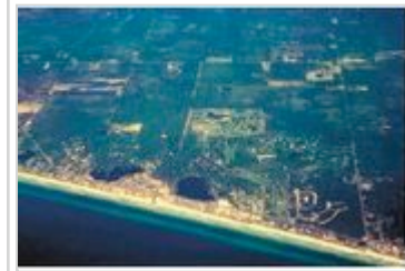
Some coastal dune lakes in 75-01 contain freshwater fish, with saltwater fish in the more saline bottom layers.

75-07. The Marion Hills lake region, generally 75-180 feet in elevation, is an area of horse farms, pasture for cattle, cropland, and mixed evergreen