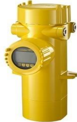
Figure 4. Fixed Density Gauge

Although typically shielded, radioactive sources used in fixed gauges can be dangerous if the shielding fails or the source becomes exposed. A radioactive source commonly used in fixed gauges is cesium-137. If a person was 1 foot away and exposed to the radiation from an 8 curie cesium-137 source, they would be subjected to a dose rate of around 25 rem per hour. Moving to 1 inch away from the source increases the dose rate to more than 3,500 rem per hour. Therefore, a person could receive a lethal dose 15 from exposure to an 8 curie cesium-137 source.