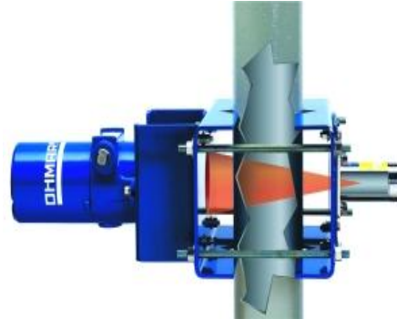
Figure 1. Cutaway View of Density Gauge

NRC's Office of Federal and State Materials and Environmental Management Programs is primarily responsible for the regulation of GLDs. Specifically, the Licensing Branch within the office provides program oversight for the general license program. In addition to developing and implementing technical and policy guidance, the branch is responsible for the following: