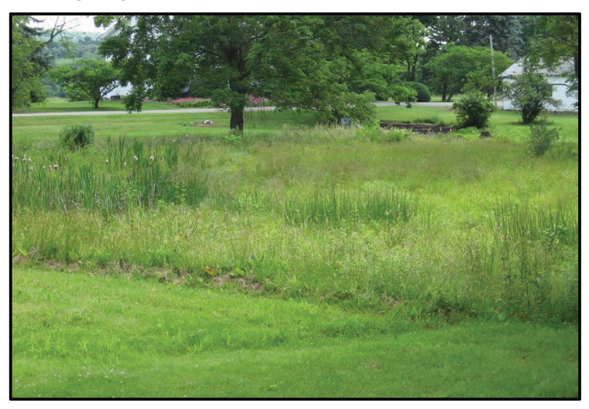
80. Emergent vegetation associated with Wetland AS.