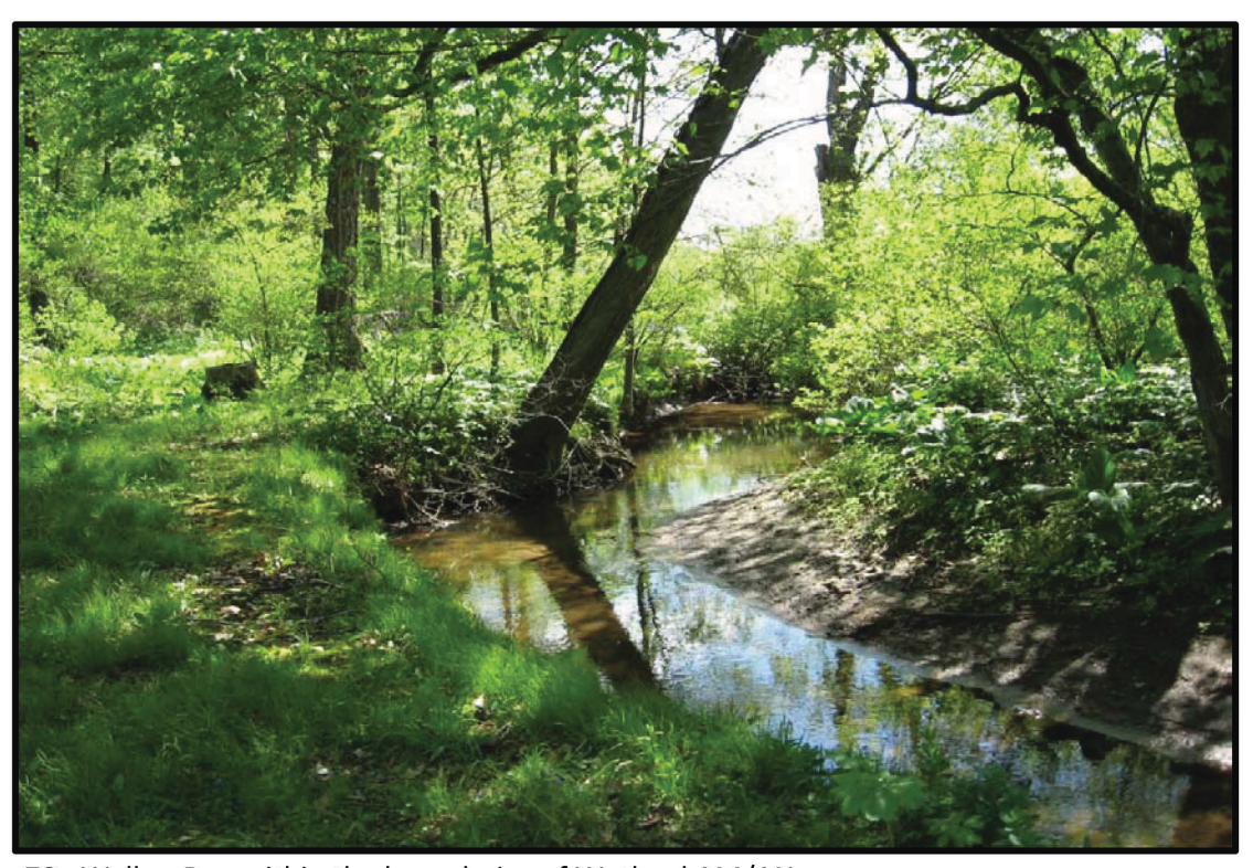
78. Walker Run within the boundaries of Wetland AM/AN.