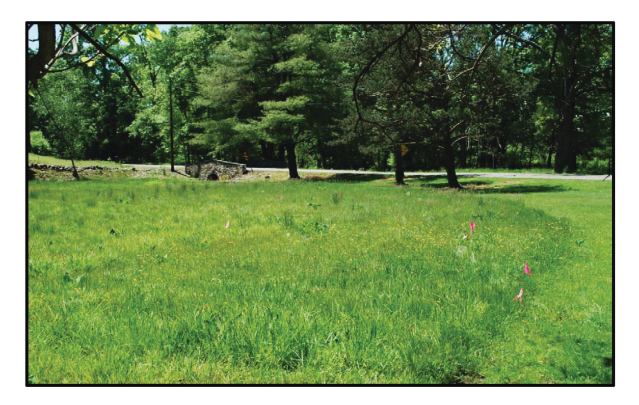
79. Boundary point AS20 (far right) marks the transition from upland mowed field to emergent vegetation.