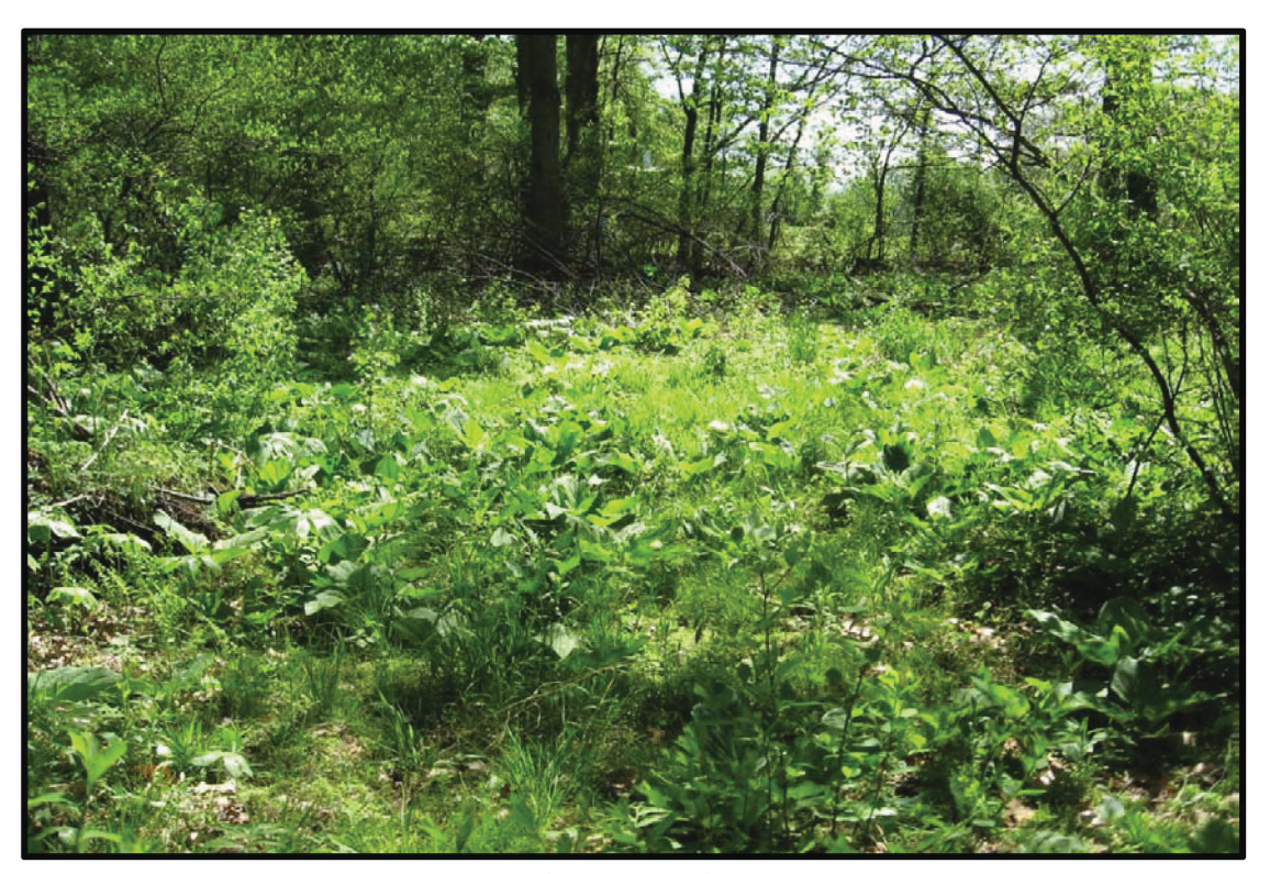
77. Emergent vegetation occurs in the floodplain of Walker Run near boundary points AN11 and AN12 of Wetland AM/AN.