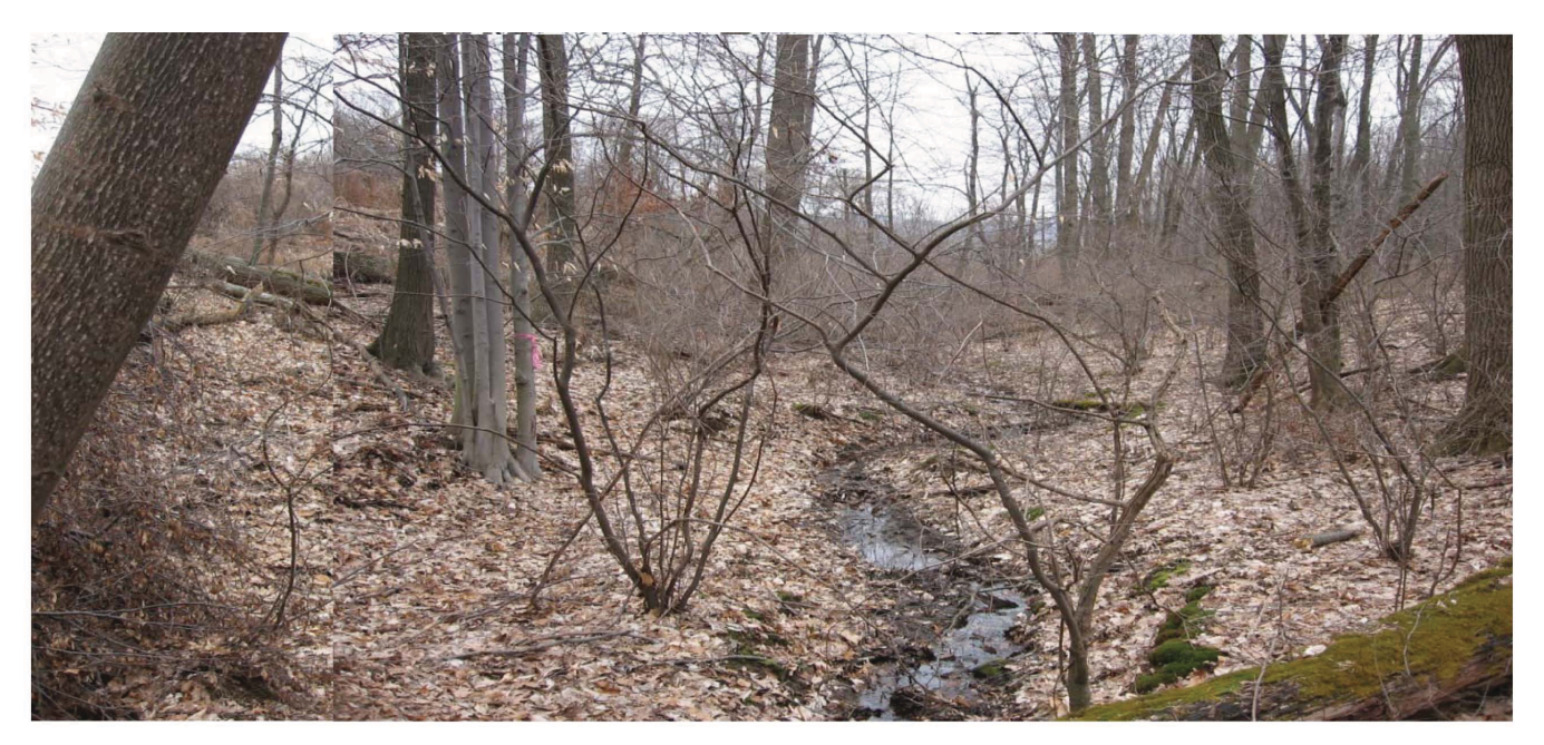
56a. Palustrine scrub/shrub wetlands bounding a small groundwater seepage channel. Boundary point Z128 is visible at center-left.