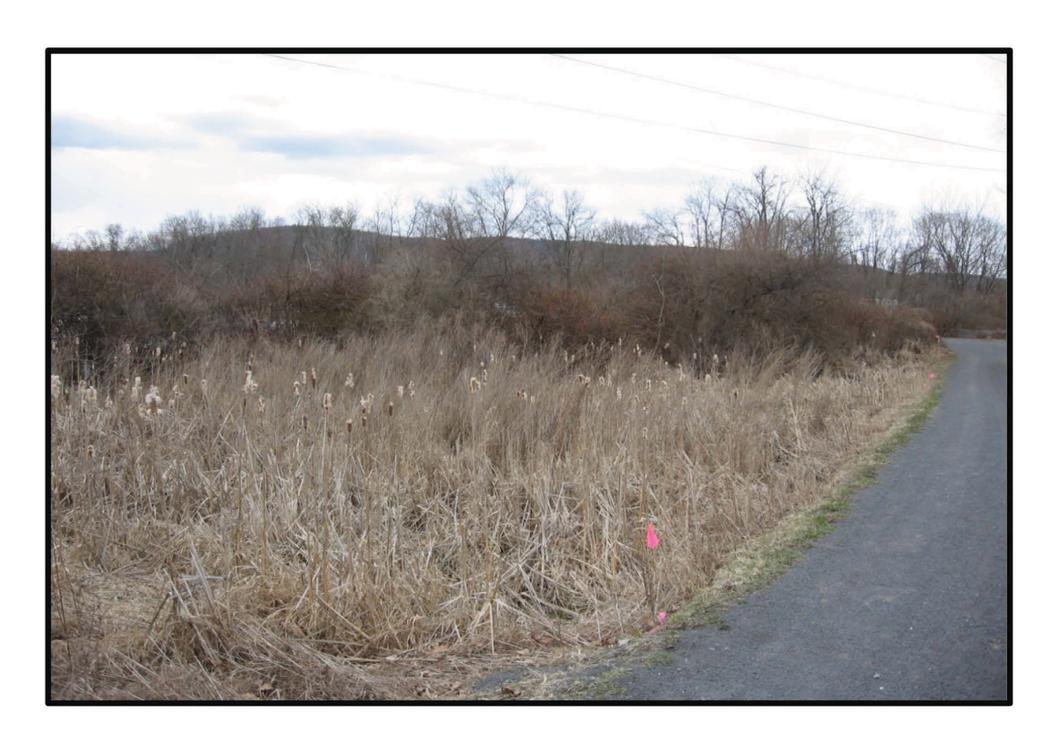
60. Many wetlands within the Riverlands section of the study area are bounded by existing trails and roads.