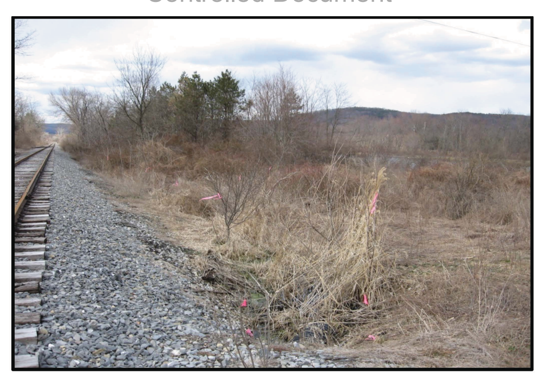
59. Wetlands along the southern edge of lake Took-A- While.