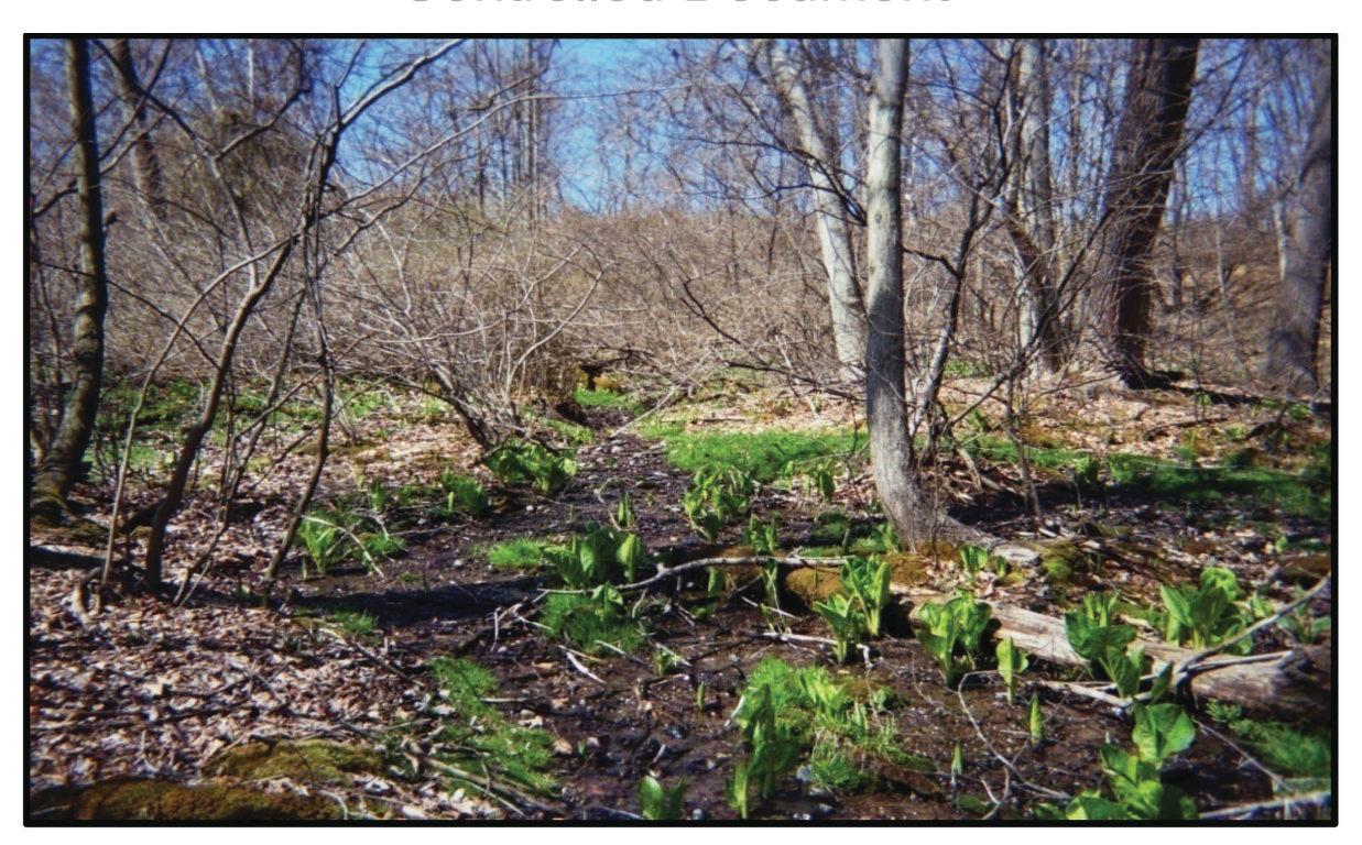
57. Groundwater seeps vegetated by spicebush and skunk cabbage.