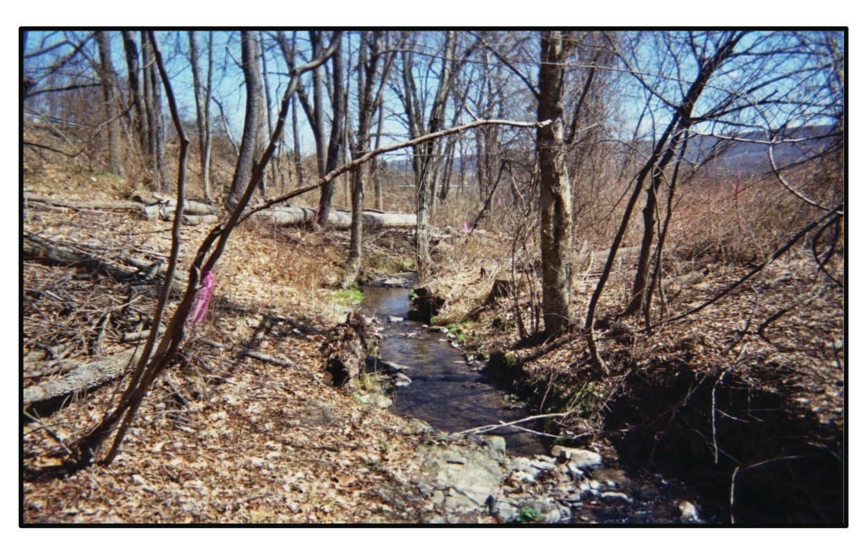
58. A typical view of the stream channel looking downstream from Z42.