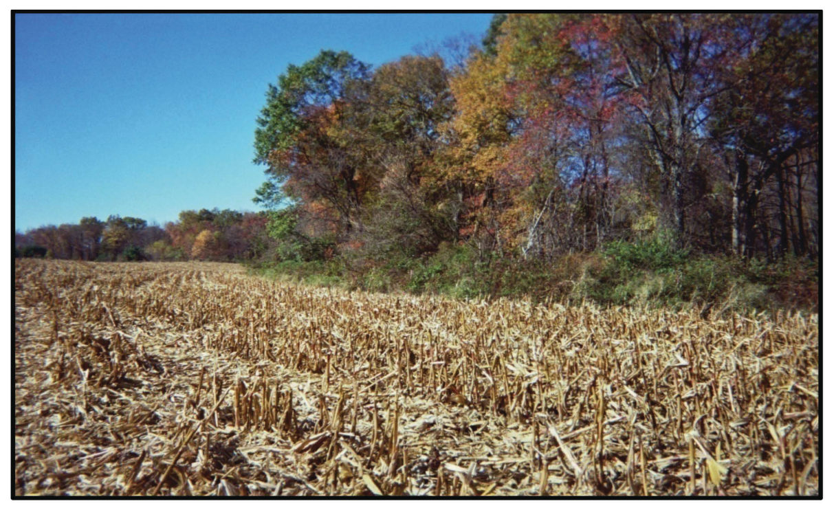
21. Cropland adjoins much of the eastern section of the AA wetland boundary.