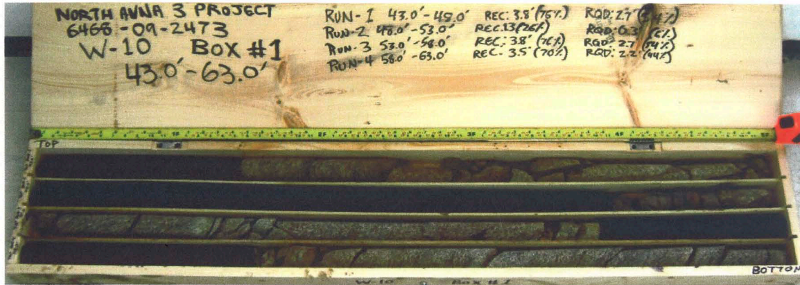
W-10- Box 1