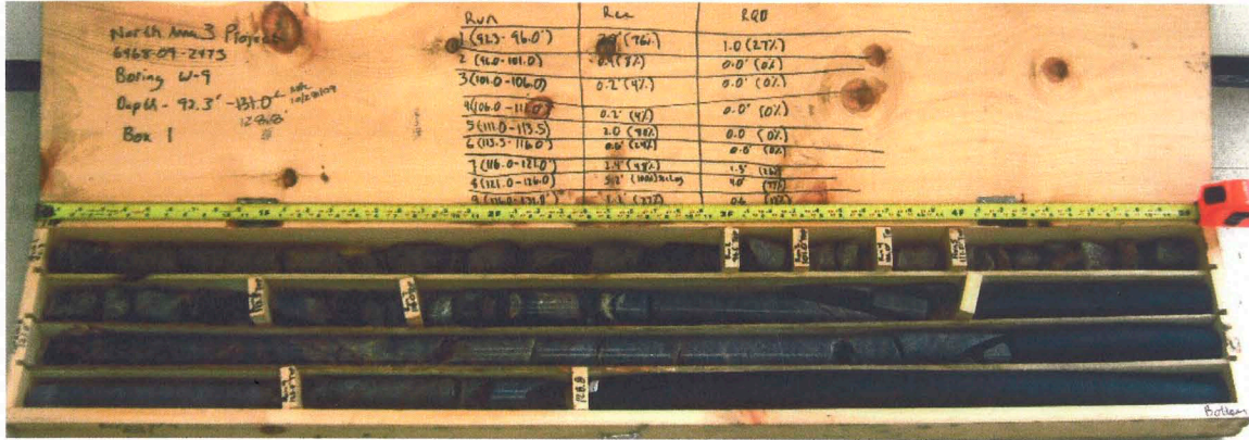
W-9- Box 1