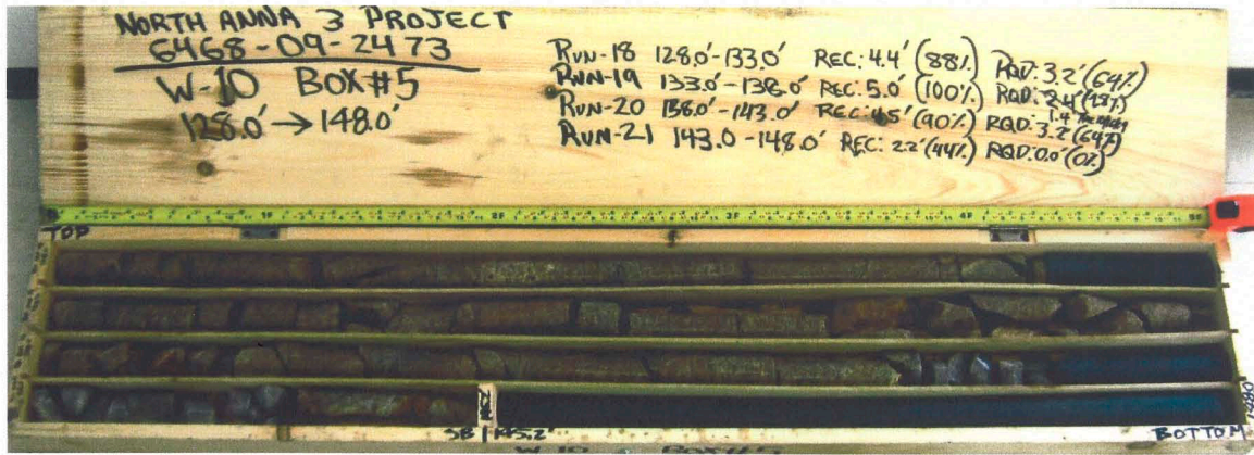
W-10 - Box 5