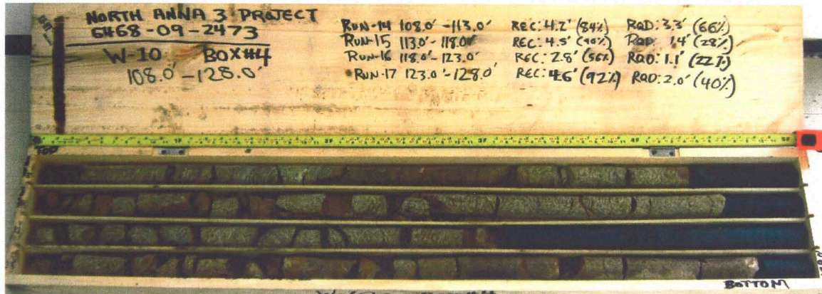
W-10- Box 4