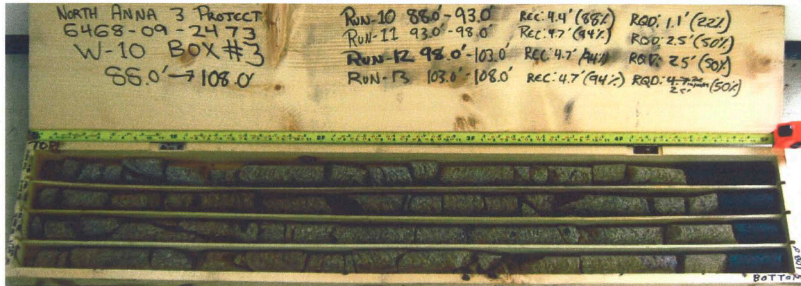
W-10- Box 3