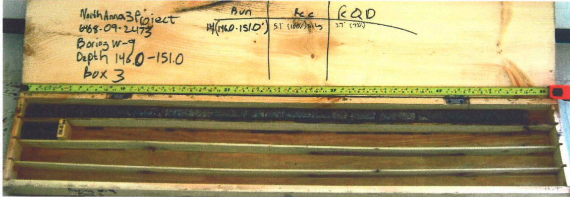
W-9- Box 3