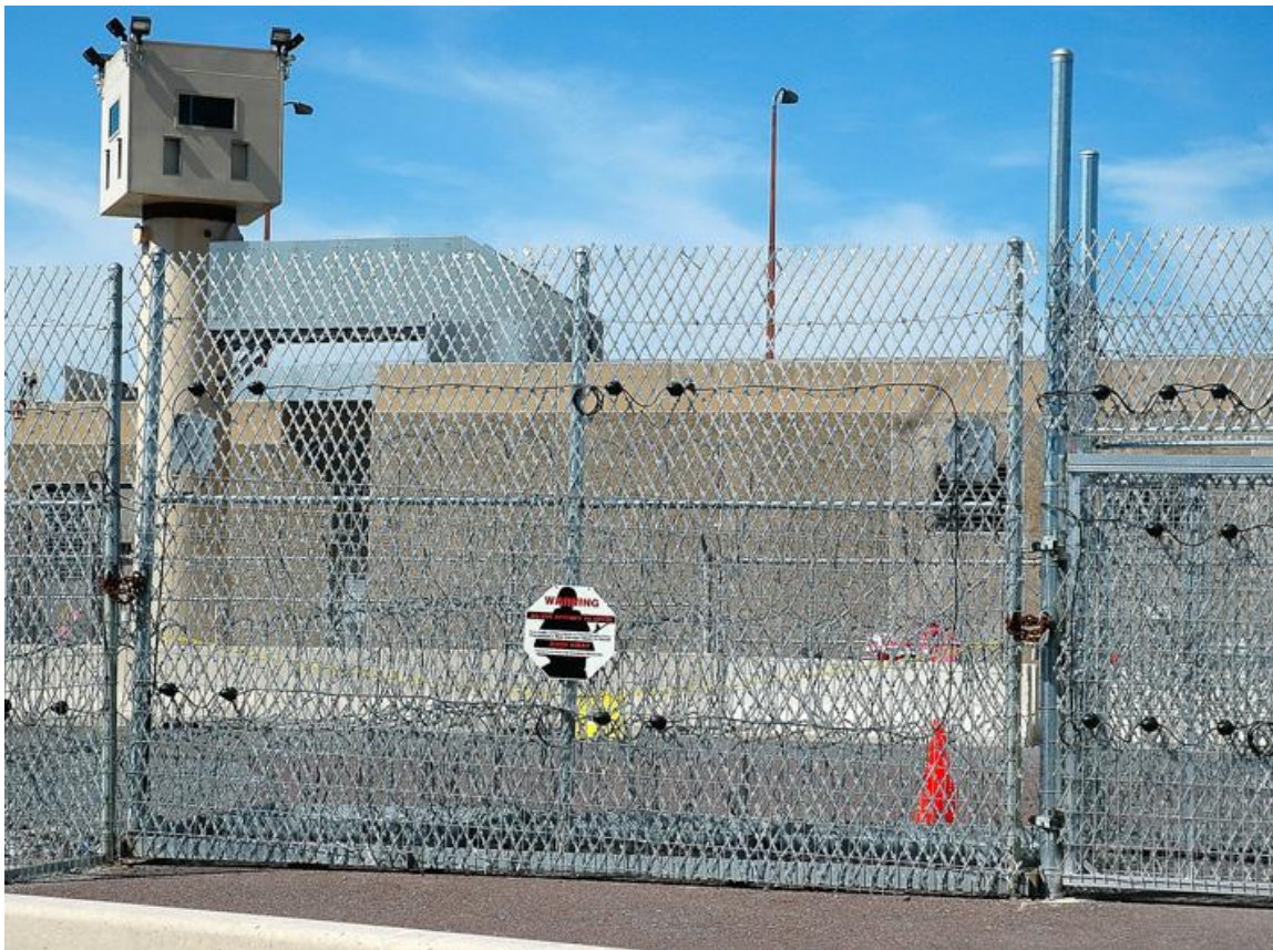
Figure 2: Security Barriers at a Nuclear Power Plant

Figure 2 shows security barriers, which are one of many security system elements that NRC staff inspect at nuclear power plants.