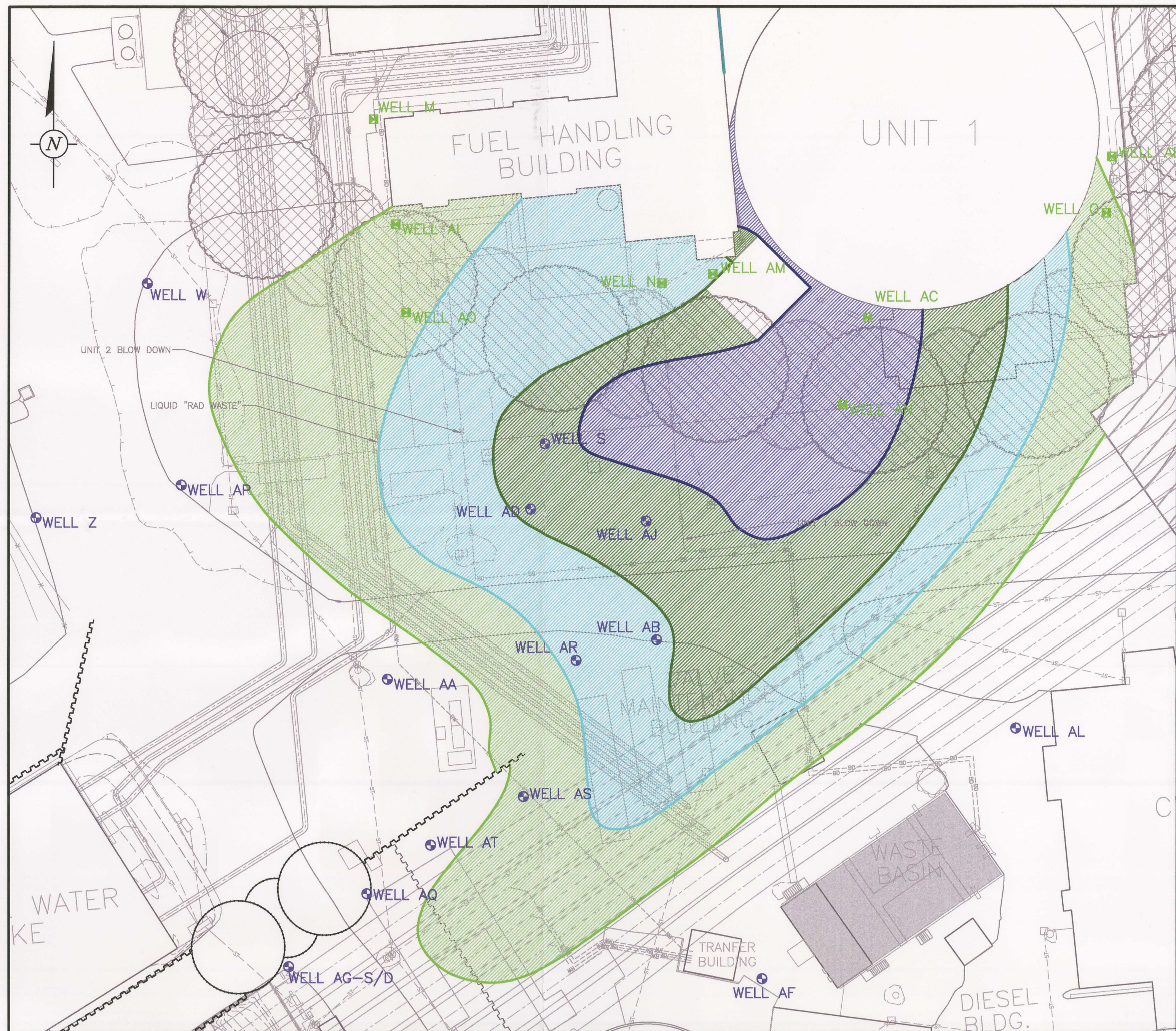
BASELINE TRITIUM PLUME - PRE-GROUNDWATER EXTRACTION - MARCH 2004 SCALE: 1"=30'