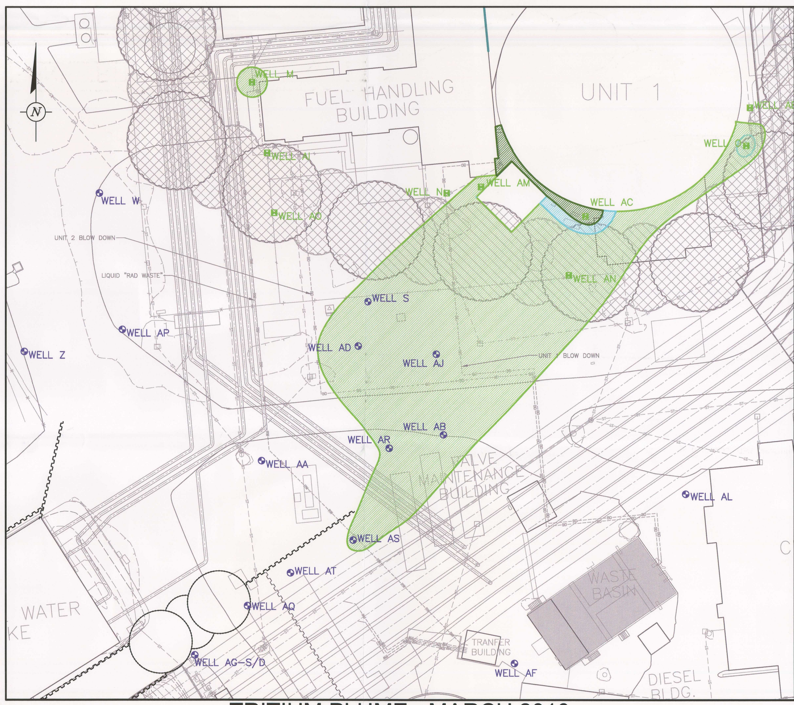
TRITIUM PLUME - MARCH 2010 FULL SCALE SYSTEM IN SERVICE SCALE: 1"=30'