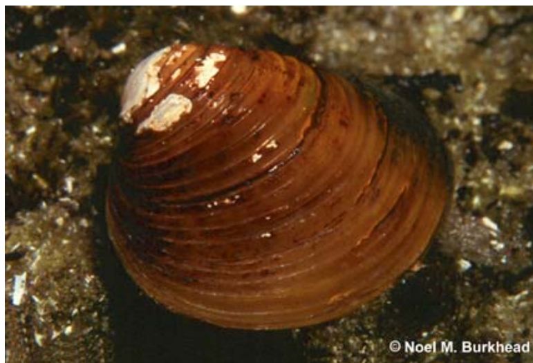
Noel Burkhead - USGS