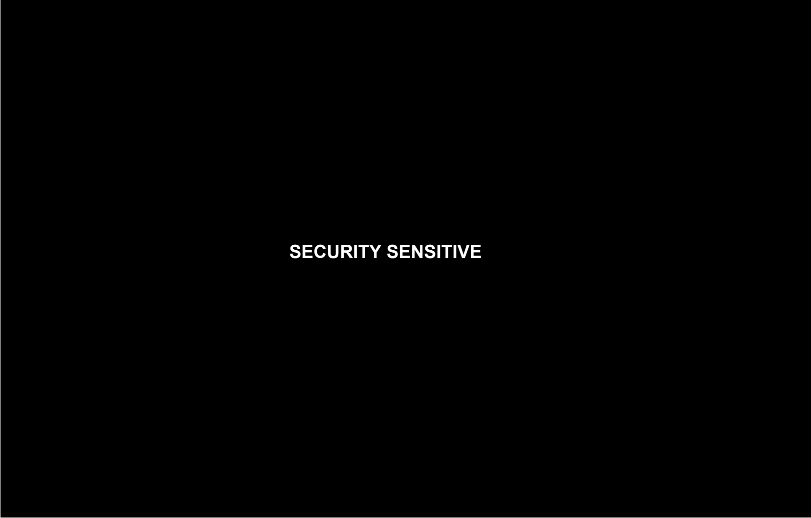
Figure 3.2p Control Building Radiation Zone Map for Full Power Operations, Section B-B