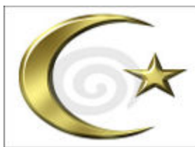
Obama's State United Nations