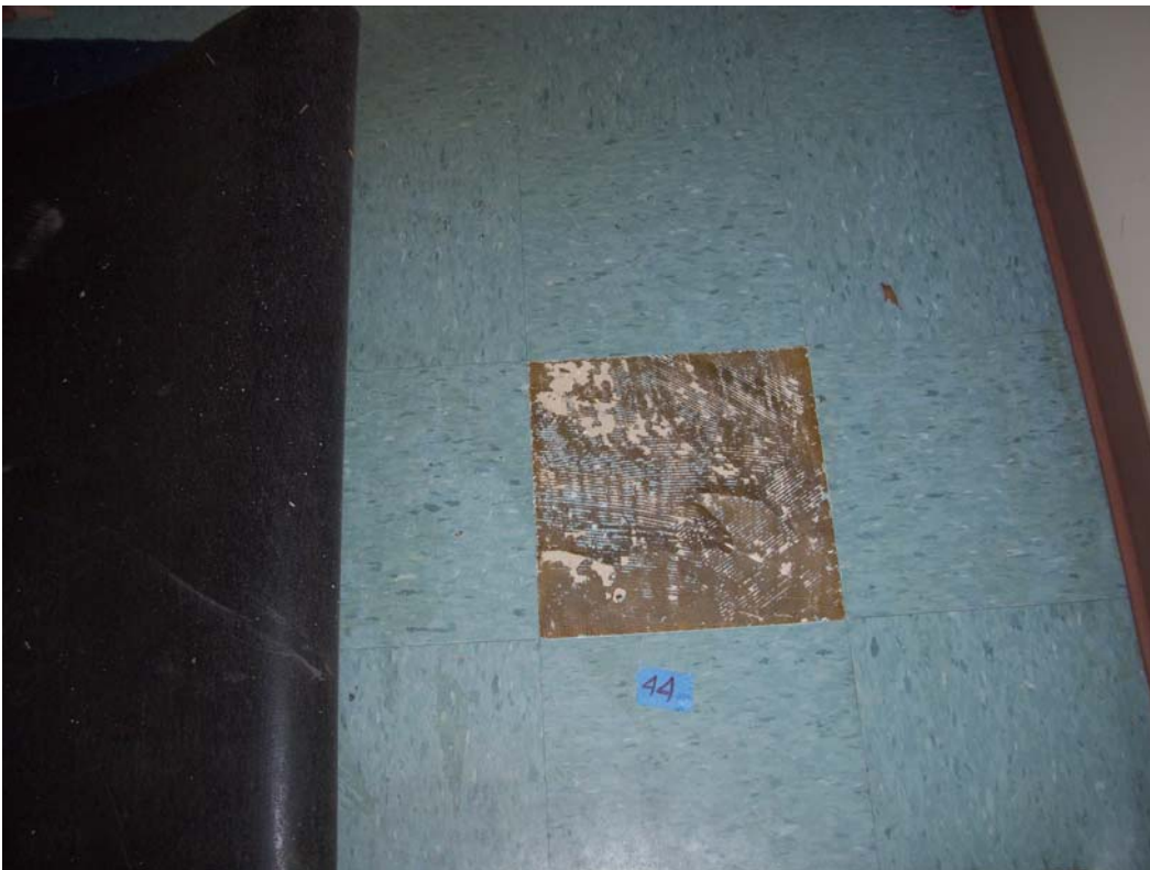
Figure D-12: Building 512