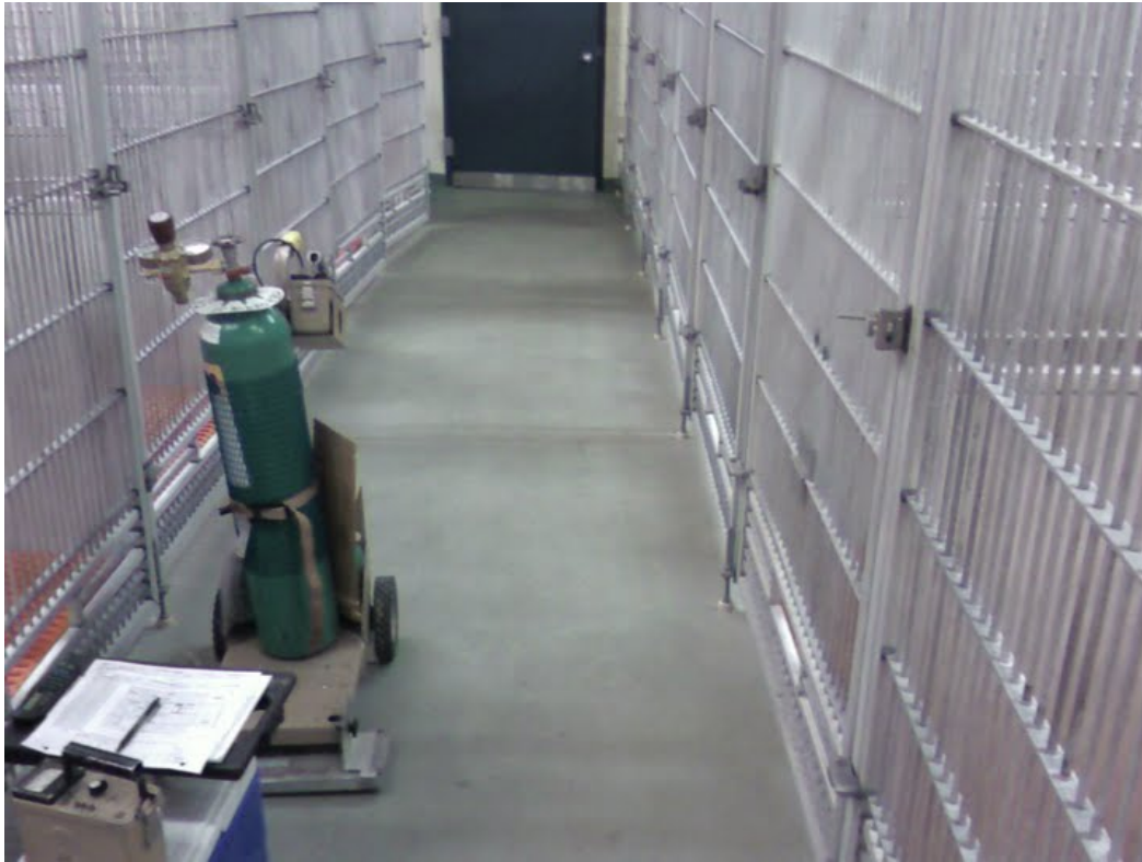
Figure D-1: Building 511 (Animal Cage) – Floor Scan