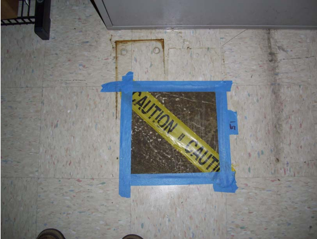
Figure D-9: Building 512