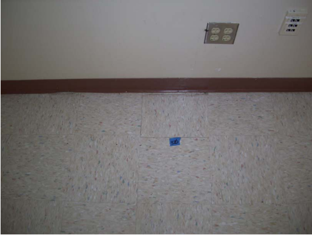
Figure D-11: Building 512