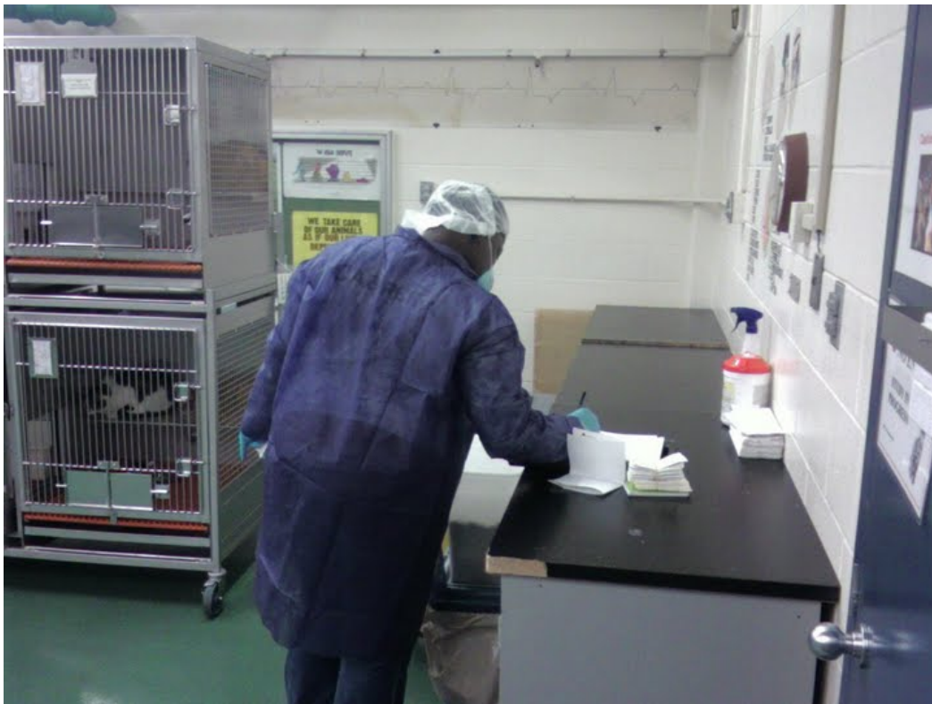
Figure D-4: Building 511 (PPE)