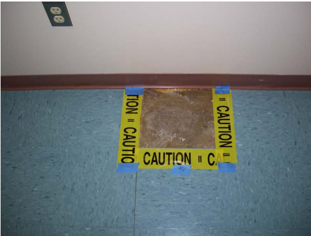
Figure D-6: Building 512