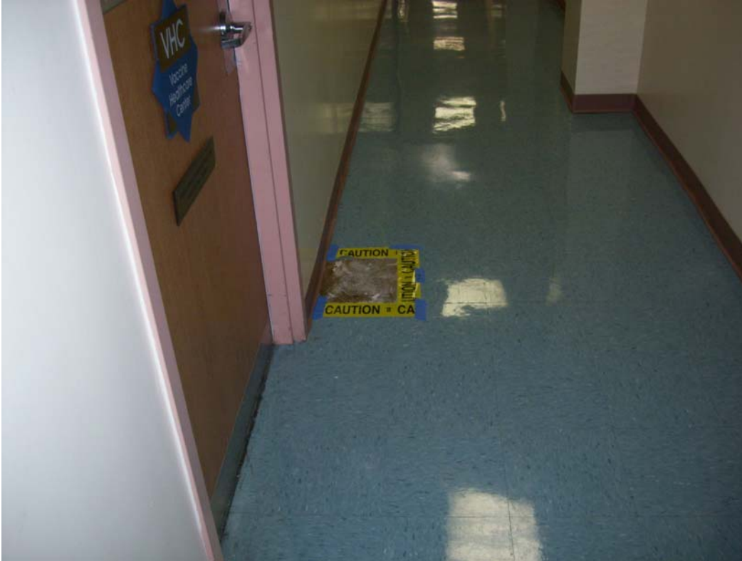
Figure D-13: Building 512