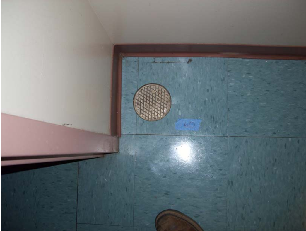
Figure D-15: Building 512