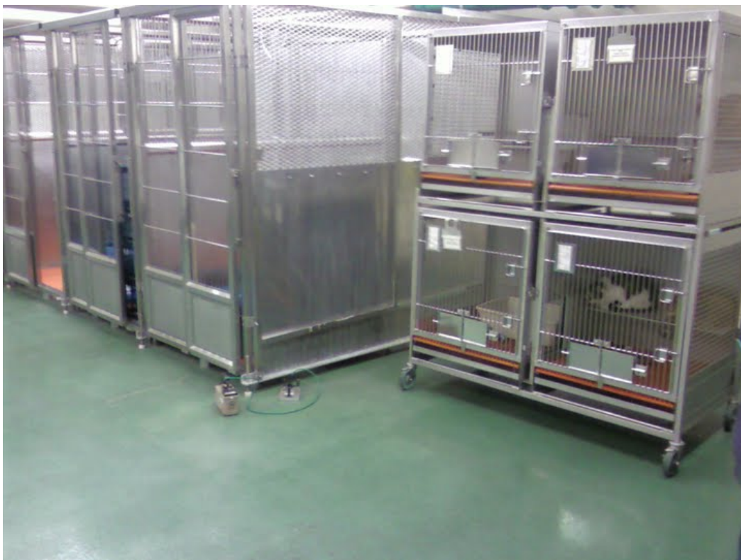
Figure D-2: Building 511 (Animal Cage)