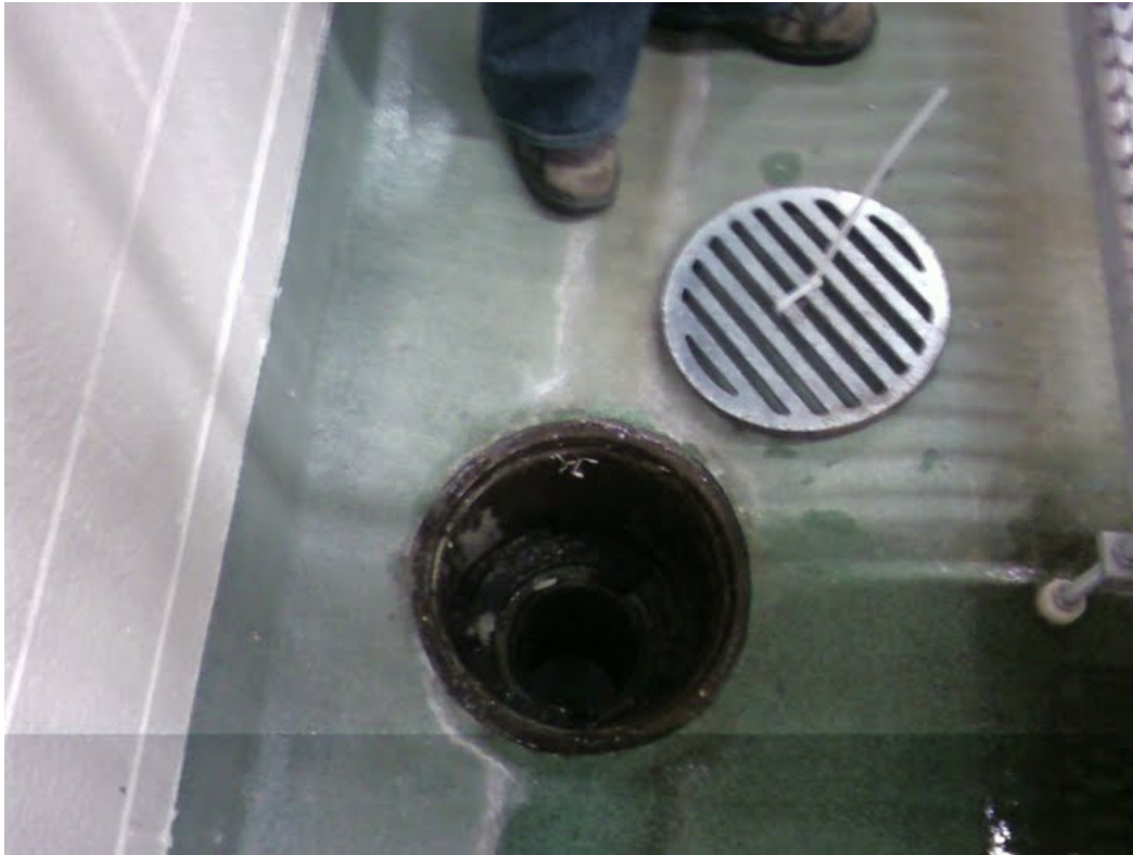
Figure D-3: Building 511 (Drain)