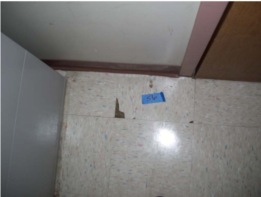
Figure D-8: Building 512