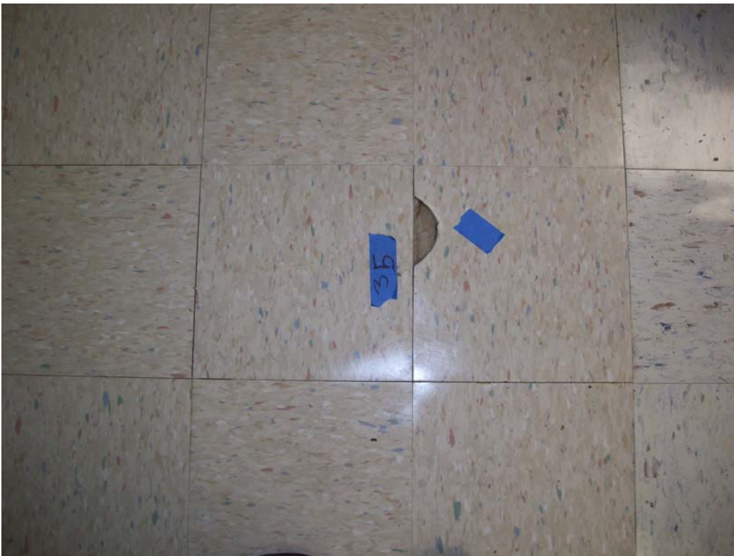
Figure D-10: Building 512