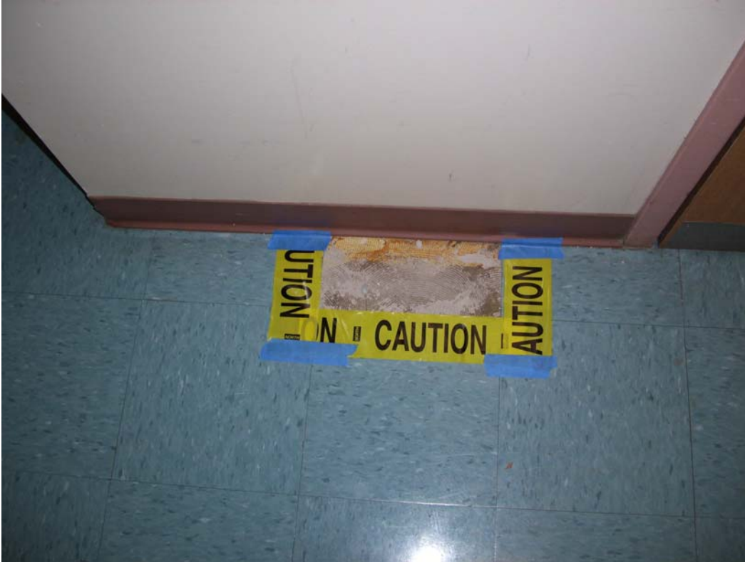
Figure D-7: Building 512