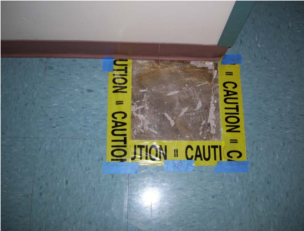
Figure D-5: Building 512