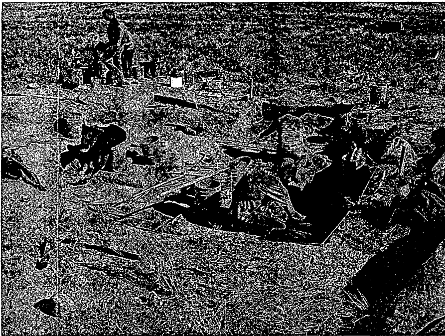
Typical of terrain (MW004 Site)

8:15 - Meet in town to caravan out to site - drive out in 4-wheel drive vehicles 9:00 – Arrive at site (parking just beyond potato sheds) 9:15 – Drive to MW004 (walk to excavation & observe site) 9:45 – SBM/building area (corners will be staked) 10:00 – Cylinder pad storage area (corners will be staked) 10:15 – Leave site 10:30 – Arrive at Hell's Half Acre parking area (Rt. 20) 11:00 – Leave Hell's Half Acre and drive back to Idaho Falls