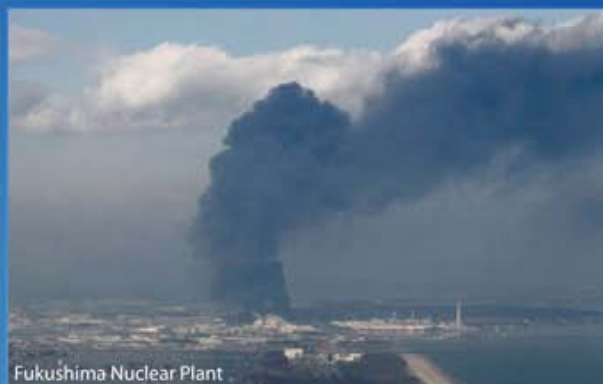
Fukushima Nuclear Plant

REGULATORY LOOPHOLES AT U.S. NUCLEAR PLANTS