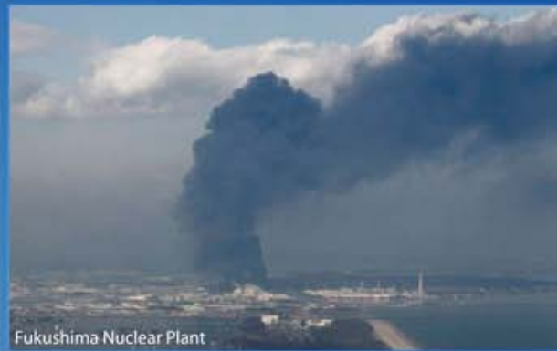
Fukushima Nuclear Plant

REGULATORY LOOPHOLES AT U.S. NUCLEAR PLANTS