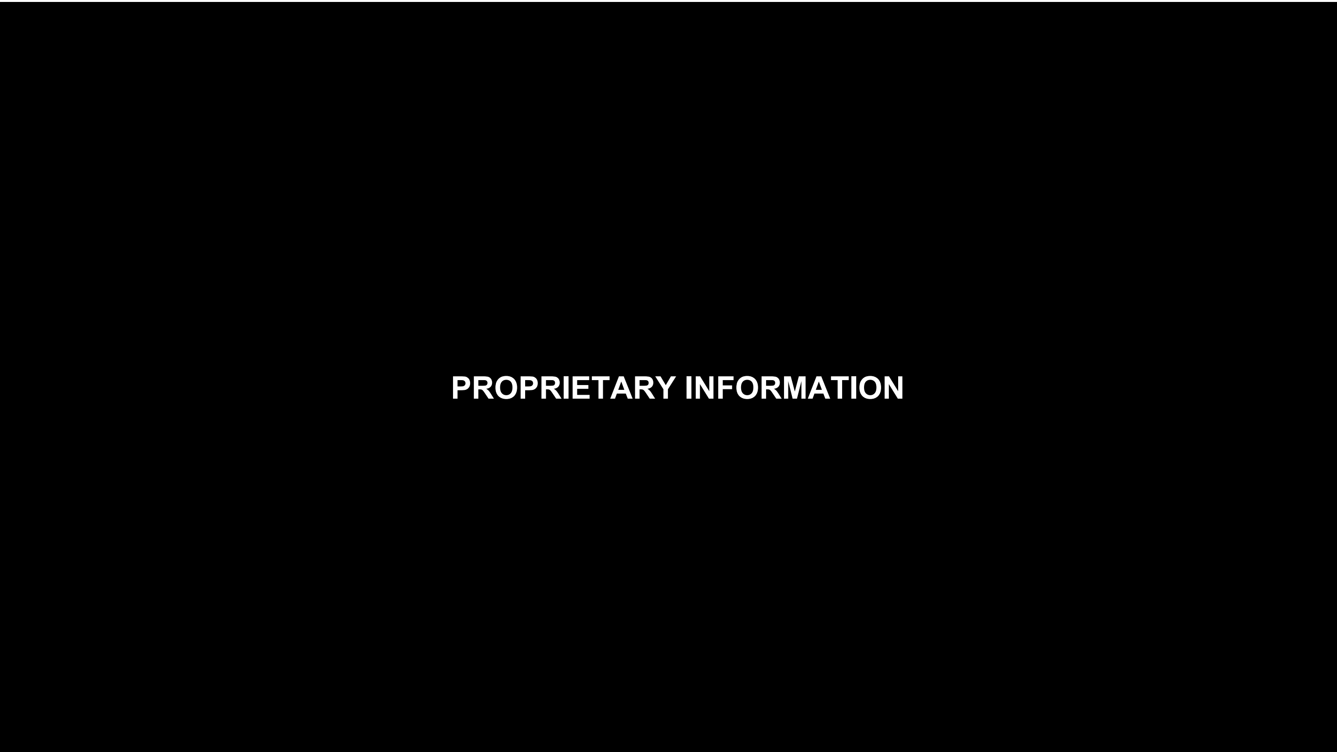
Figure 1.2-24 – Turbine Building, General Arrangement at Elevation 2300 mm