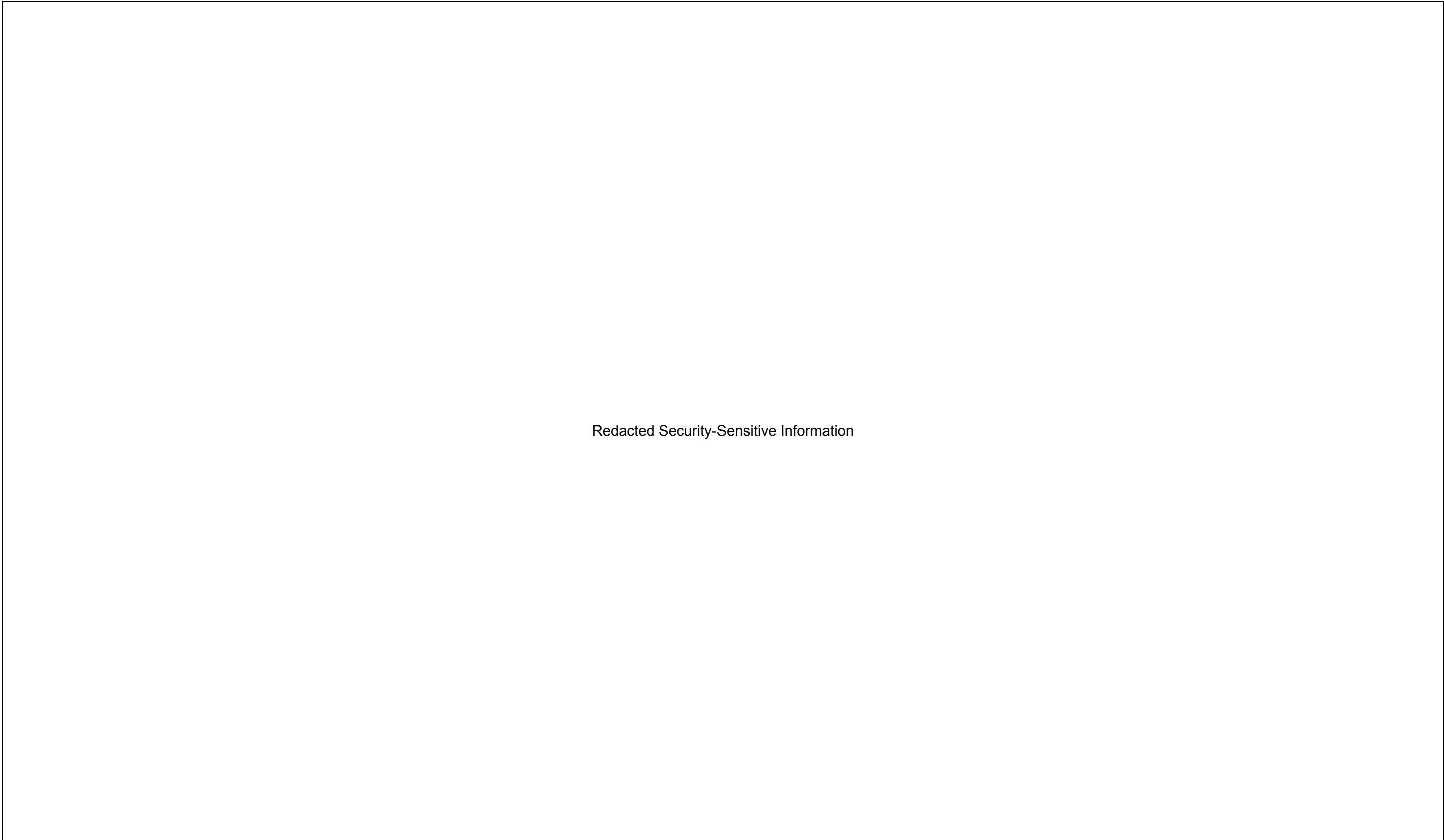
Figure 12.3-69 Turbine Building MB1F Floor Level, Area Radiation Monitors, Elevation 6300 mm