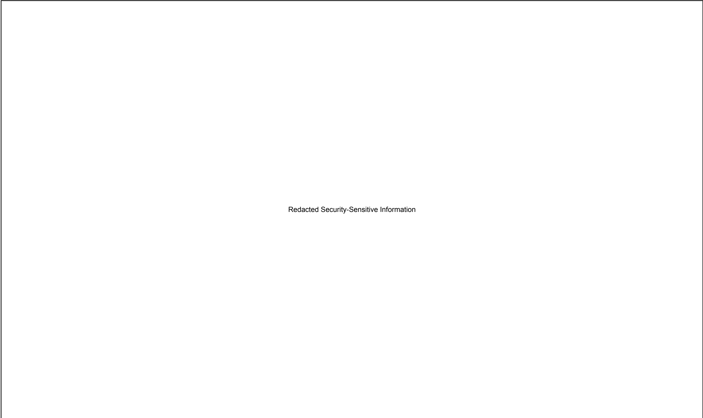
Figure 12.3-64 Control and Service Buildings, Area Radiation Monitors