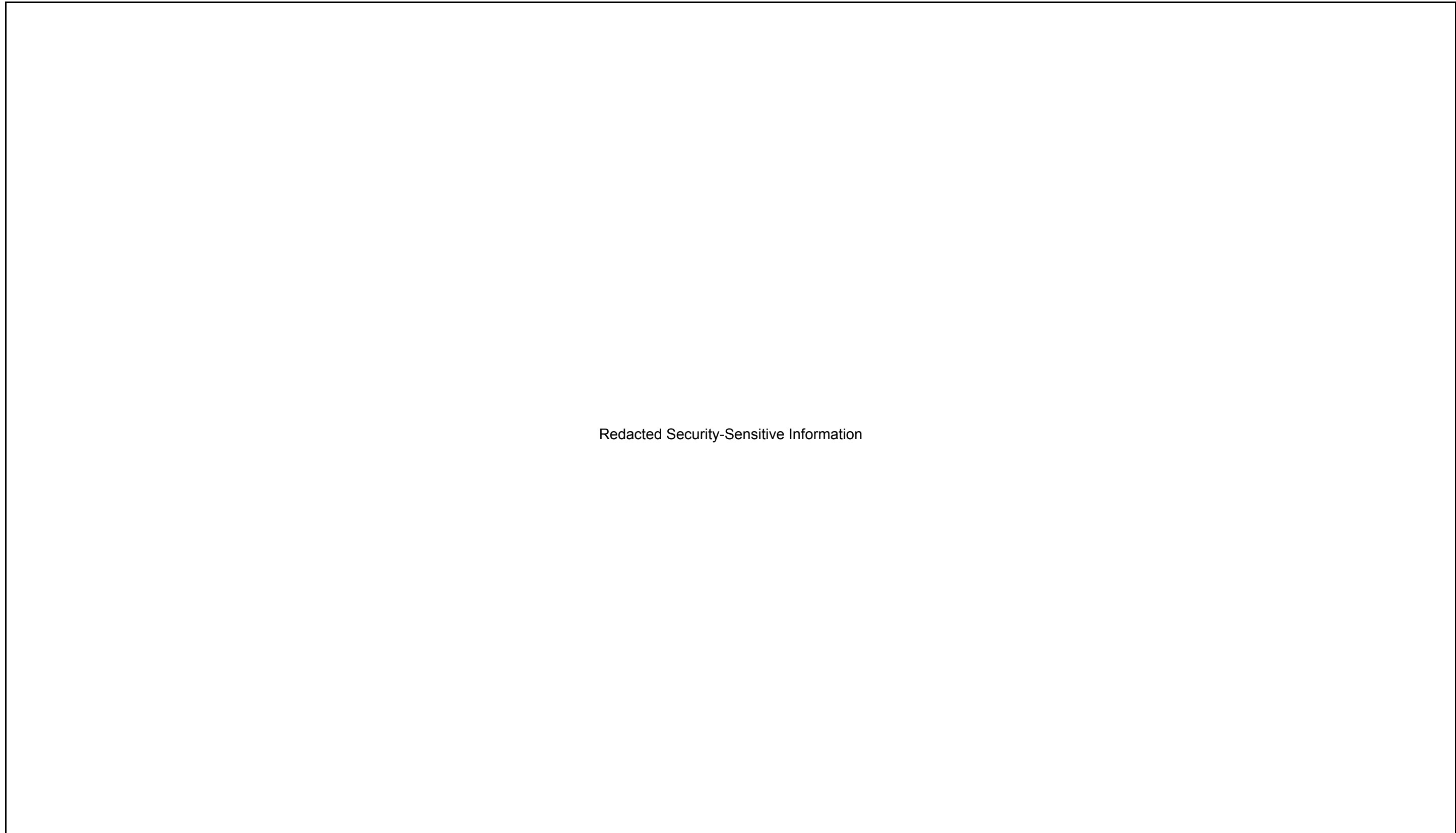
Figure 12.3-73 Turbine Building, Area Radiation Monitors, Longitudinal Section B-B