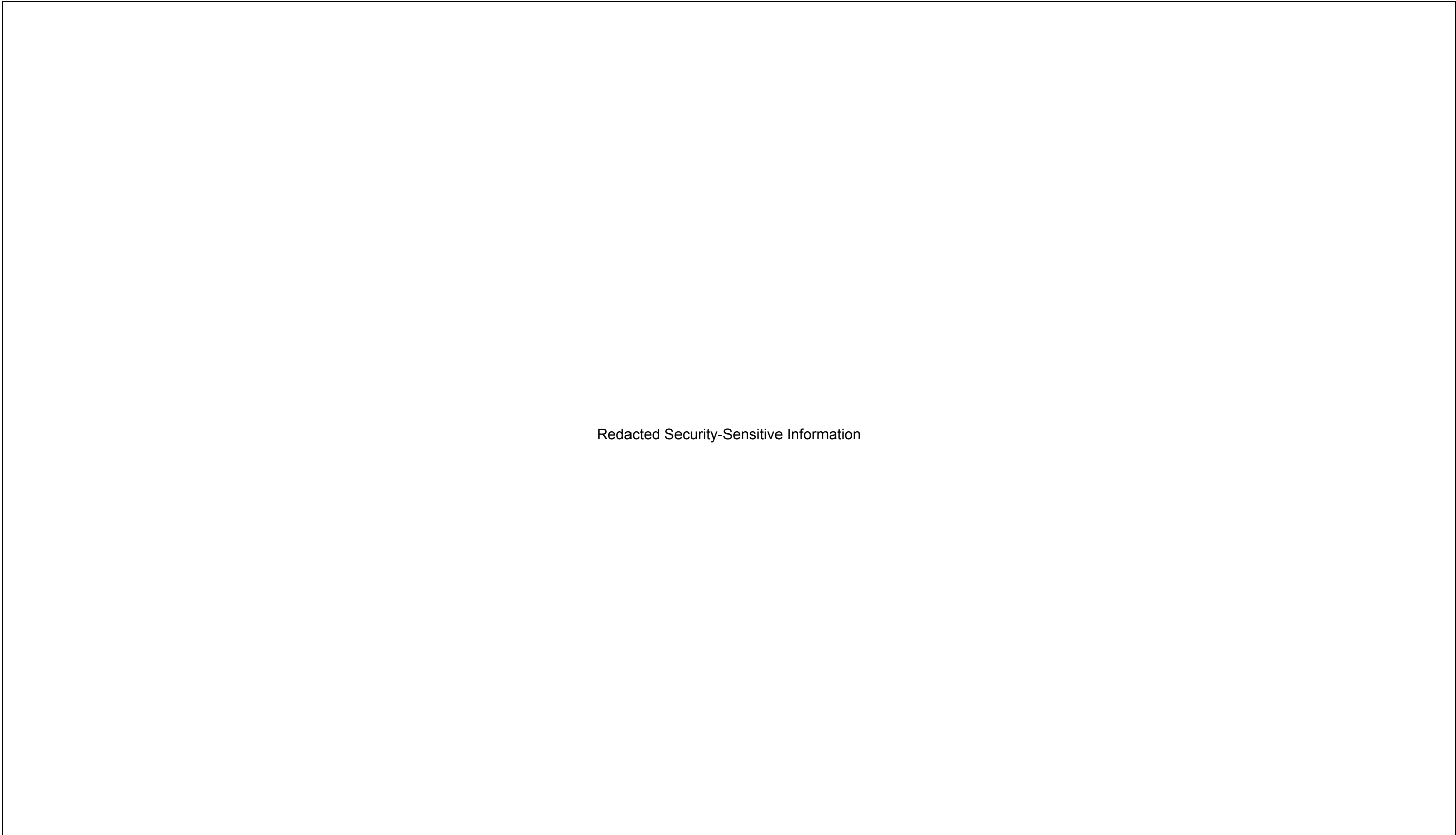
Figure 12.3-77 Turbine Building, Radiation Zone Map, at Longitudinal Section B-B