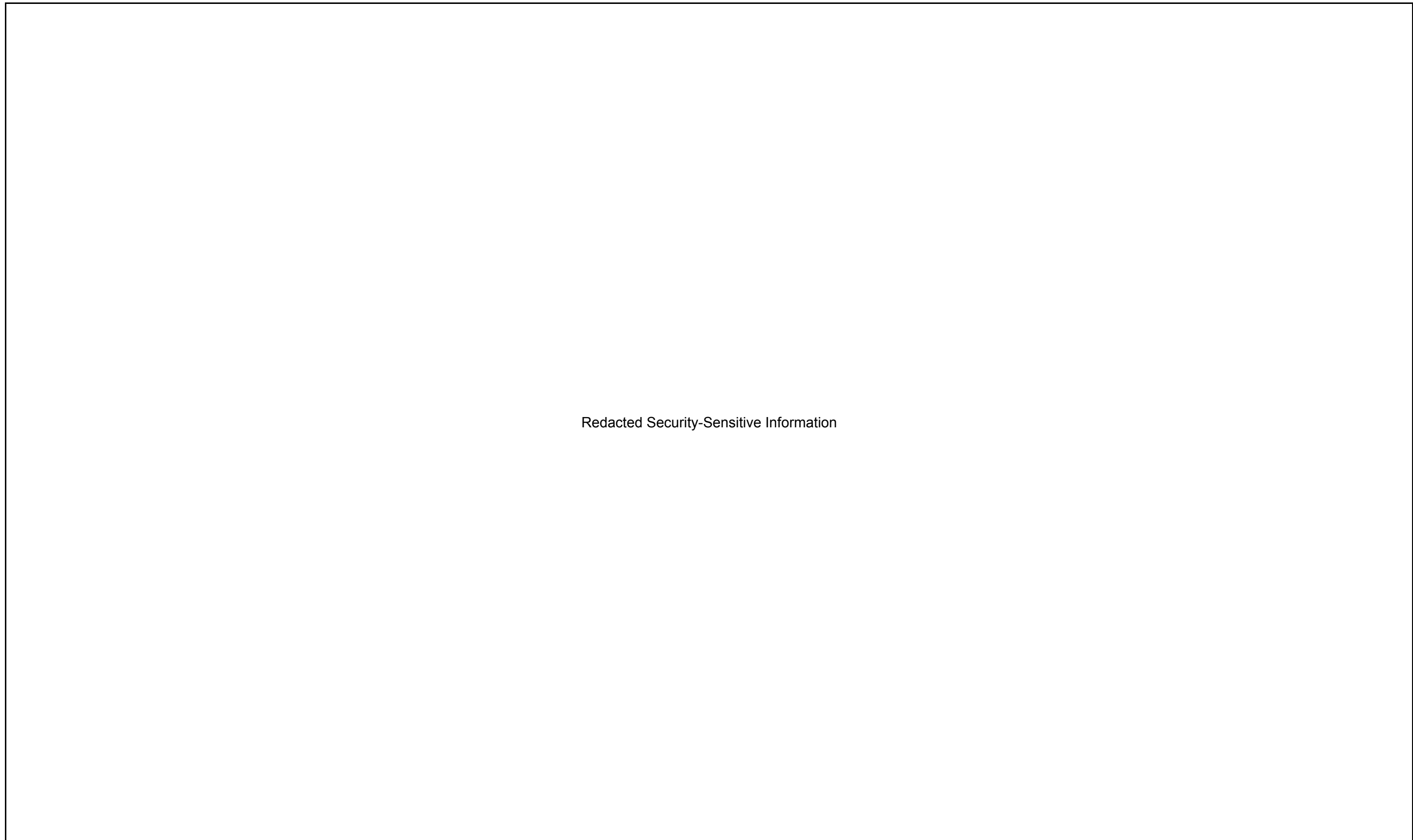
Figure 12.3-63 Reactor Building, Area Radiation Monitors, Section B-B