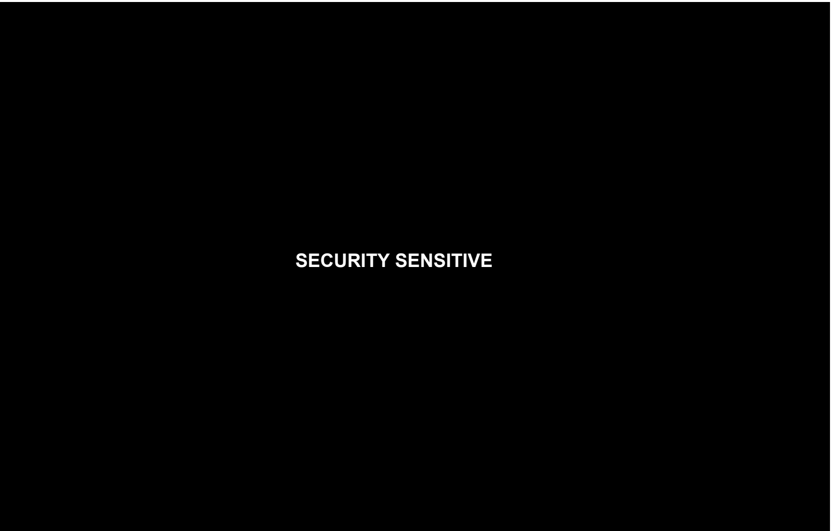
Figure 3.2p Control Building Radiation Zone Map for Full Power Operations, Section B-B