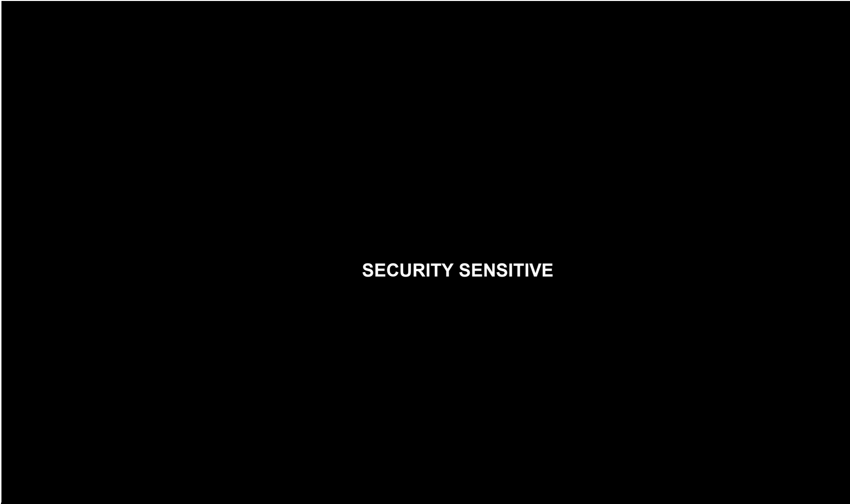
Figure 3.2u Control Building Radiation Zone Map for Full Power Operation, Floor 1F—Elevation 12300 mm