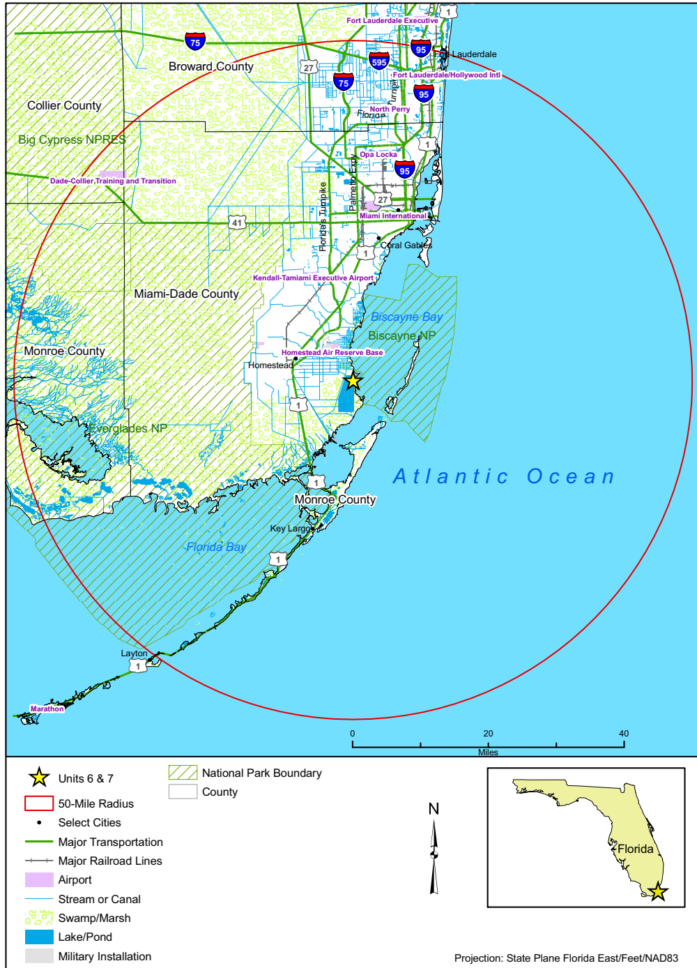
Figure 2.1-4 50-Mile Region