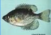
Centrarchus macropterus (flier)

This File ( /queries/FactSheet.asp ) Last Modified On: 5/7/2009 12:00:31 PM