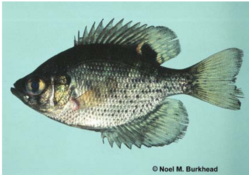
Noel Burkhead, USGS

Centrarchus macropterus ( Lacepède, 1801 )