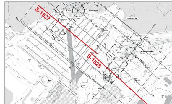
Location of Seismic Profiles