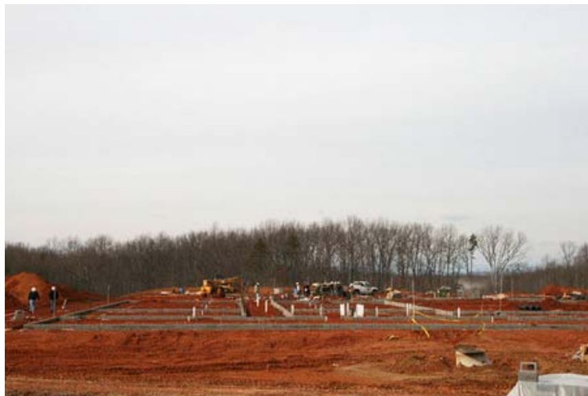
As of January 12, 2009, construction workers are currently digging and preparing the footings for the gym and cafeteria areas.