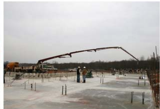
As of February 18, 2009, construction workers have started to pour concrete for the floors of Moss-Nuckols Elementary School.