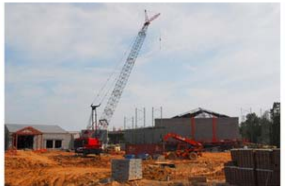
June 25, 2009