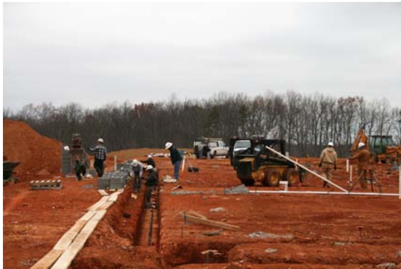
As of December 15, 2008 the footing is nearly complete for the entire building.