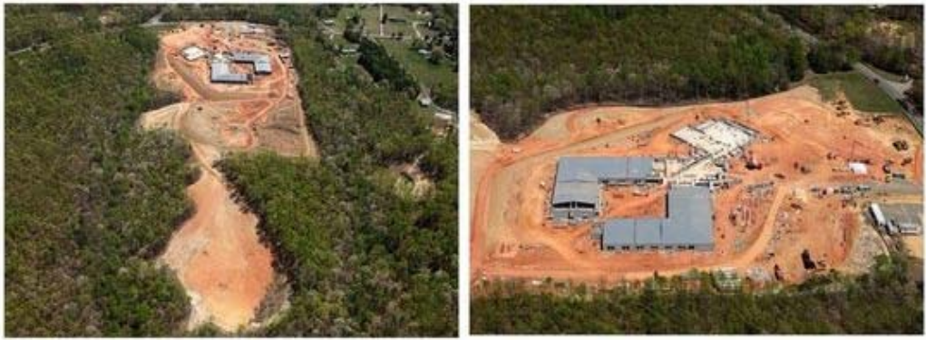
Aerial photos taken of Moss-Nuckols on April 24, 2009.