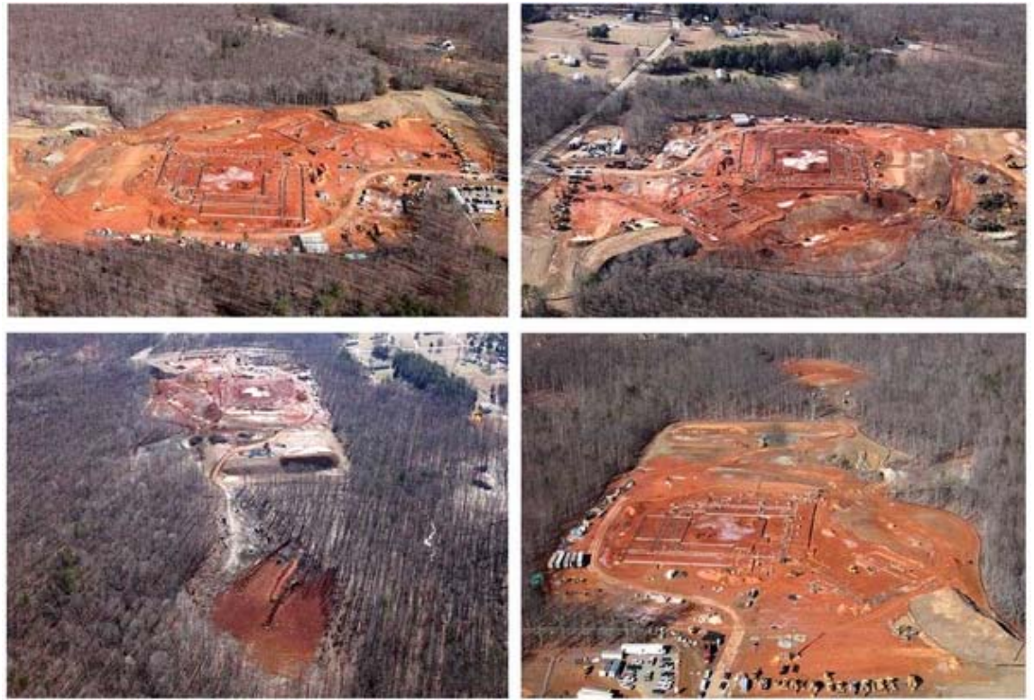
Aerial photos taken of the Moss-Nuckols Elementary School site on January 14, 2009.