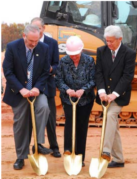
The groundbreaking of Moss-Nuckols Elementary School on November 3, 2008.

To view additional photos of the groundbreaking click here .