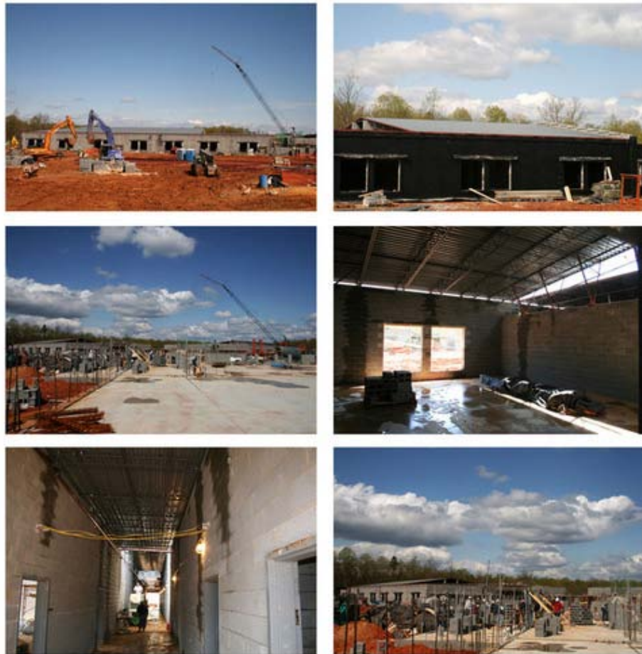
April 22, 2009