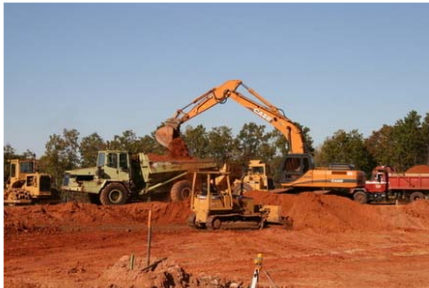
Week of October 27, 2008

To view additional photos of the groundbreaking click here .