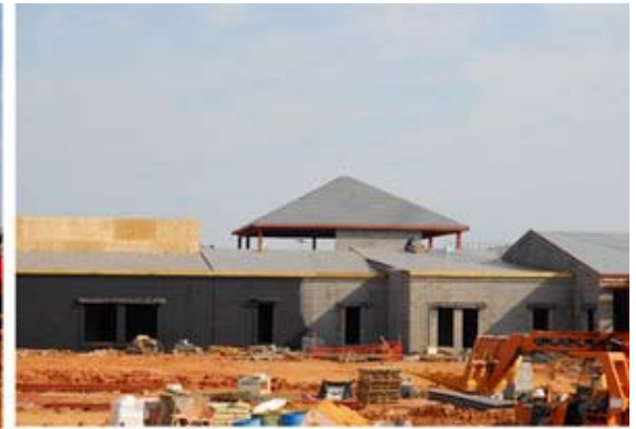
June 25, 2009