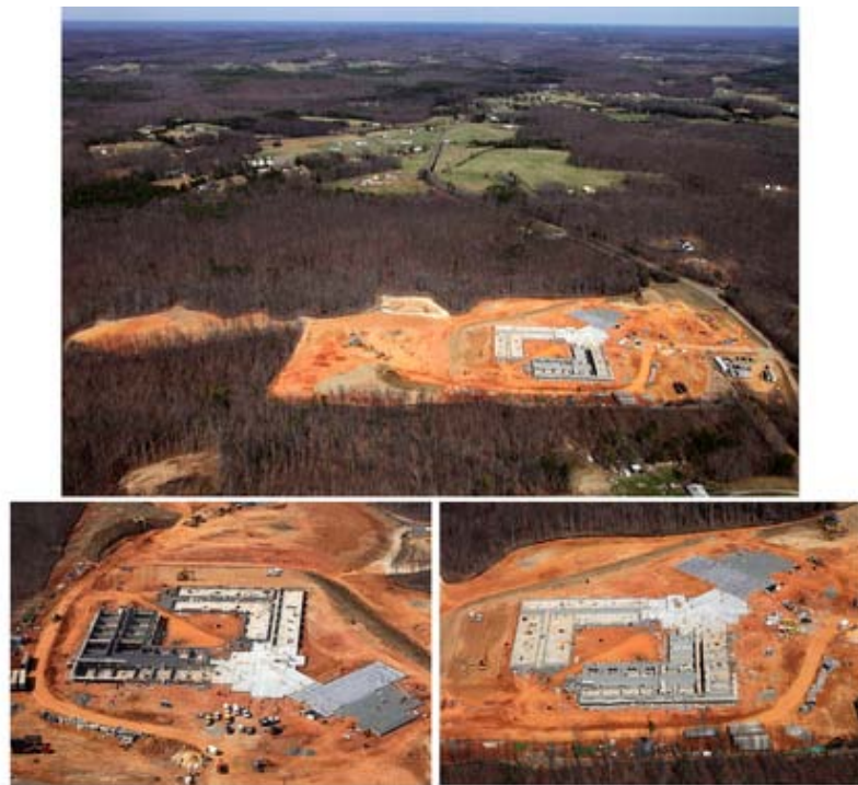
Aerial photos taken of the Moss-Nuckols Elementary School construction process on March 24, 2009.