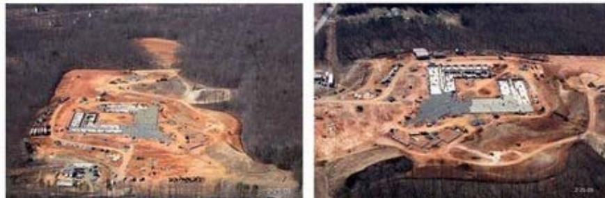
Aerial photos taken of the construction of Moss-Nuckols Elementary School on February 26, 2009.