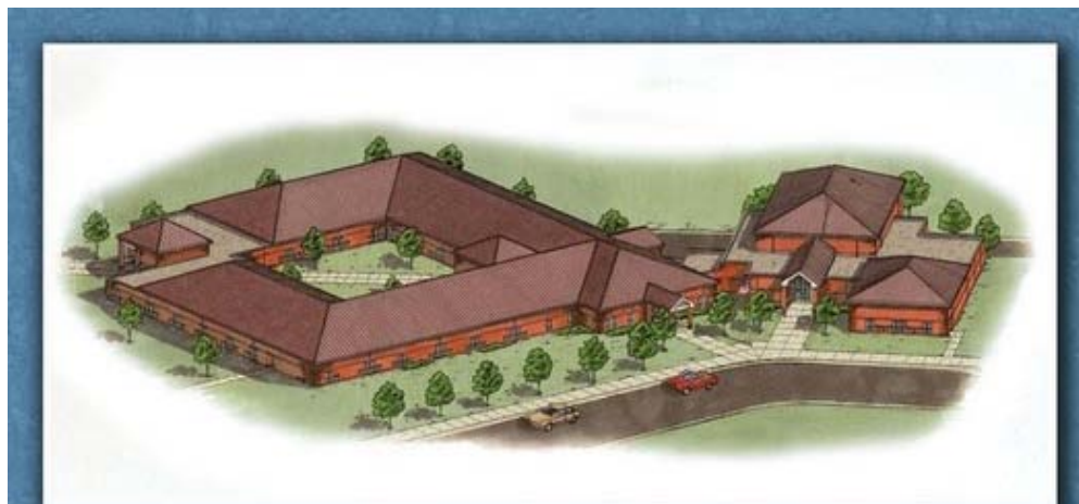
Proposed Perspective Sketch Moss-Nuckols Elementary School Louisa County, Virginia

The Louisa County Public School division is in the process of constructing its fourth elementary school. Please check back to see the building's progress!