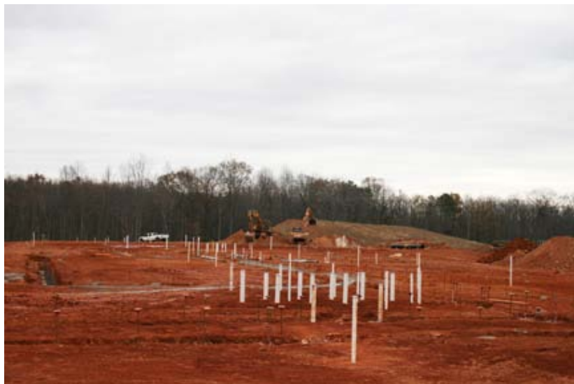
The storm sewer is nearly complete, as of December 15, 2008.