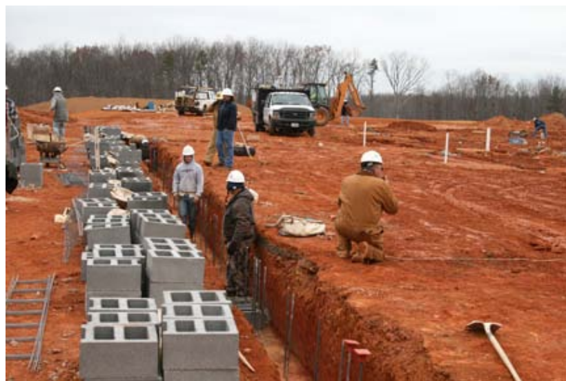
As of December 15, 2008, the blocks have started to be laid for the school's walls.