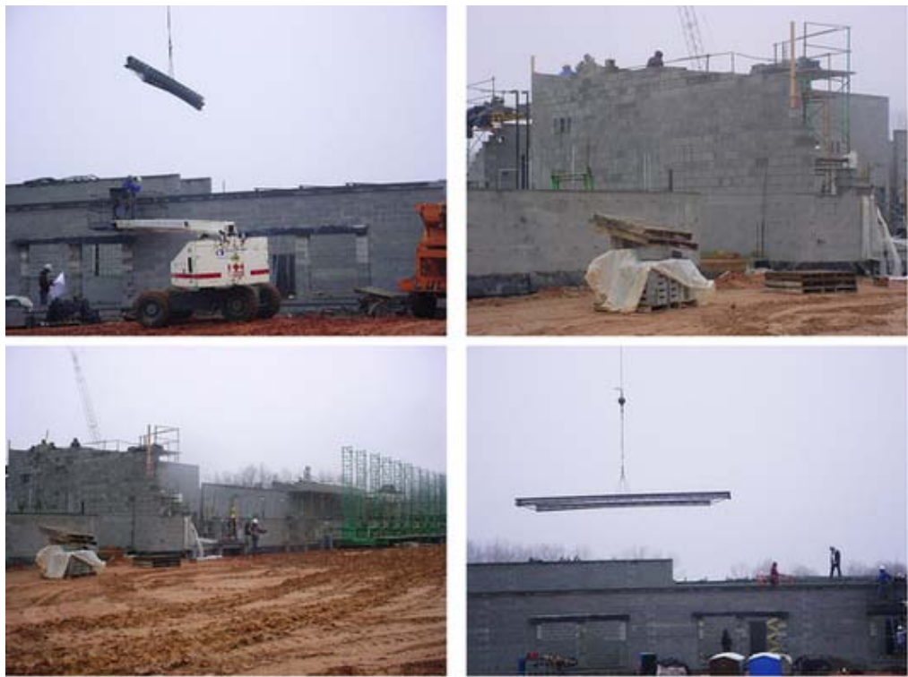
The roof trusses started to be installed on April 2, 2009.