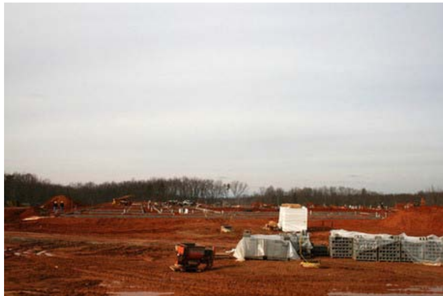
As of January 12, 2009 the walls and rough plumbing are currently being worked on.