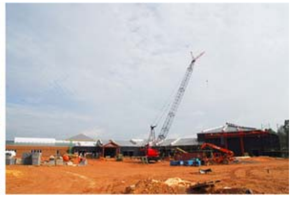
July 28, 2009