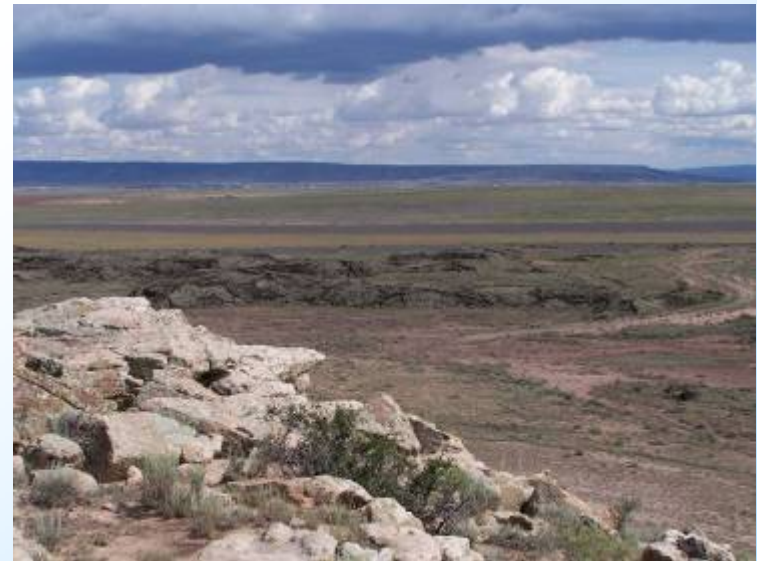
Disposal Cell at the Bluewater, NM, Disposal Site