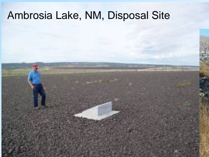
Ambrosia Lake, NM, Disposal Site