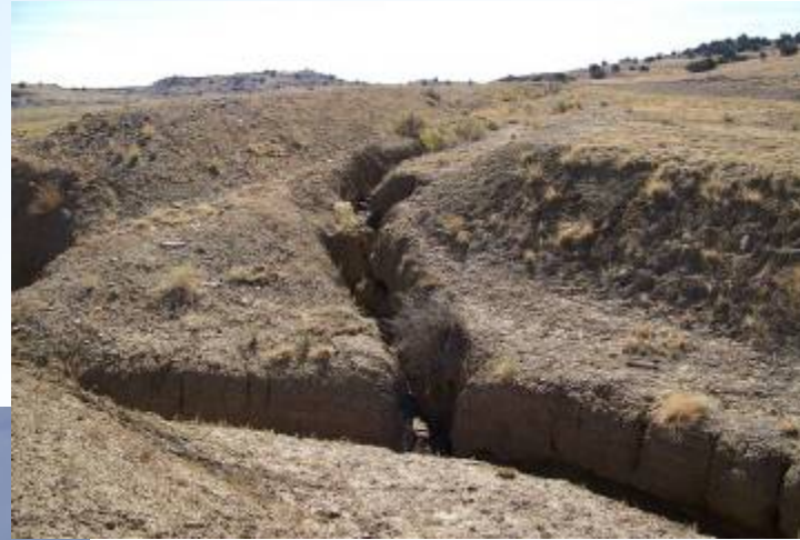
Erosion at the L-Bar, NM, Disposal Site