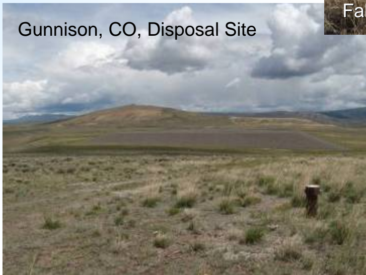
Gunnison, CO, Disposal Site