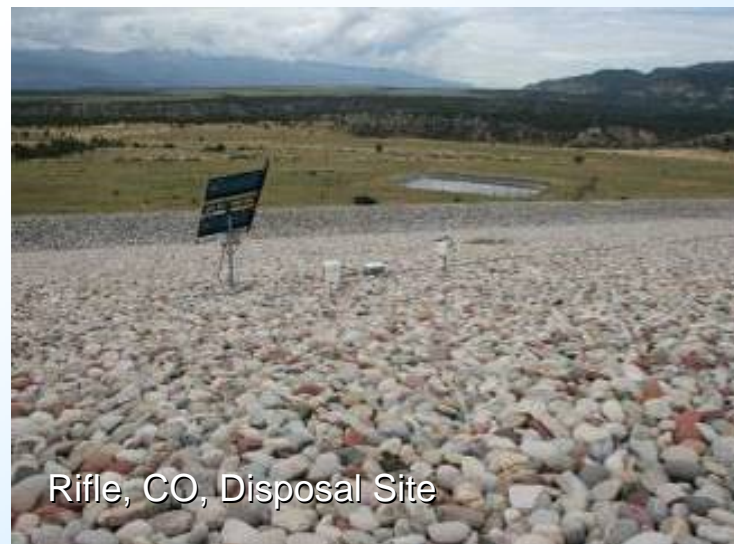
Rifle, CO, Disposal Site