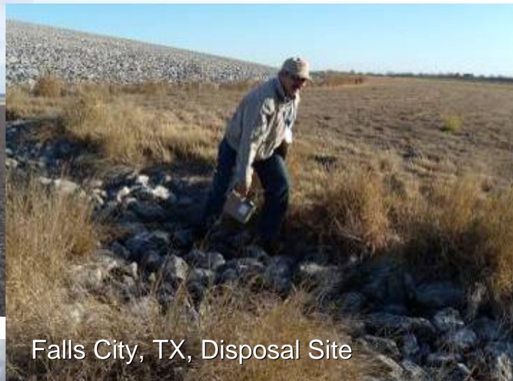
Falls City, TX, Disposal Site