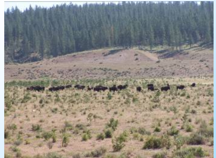
Buffalo Grazing at the Sherwood, WA, Site