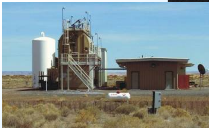
Tuba City, AZ, Site