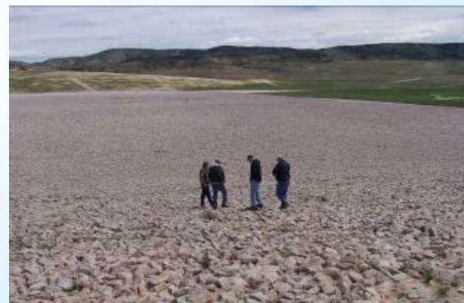
Site Inspection at the Gas Hills East, WY, Site