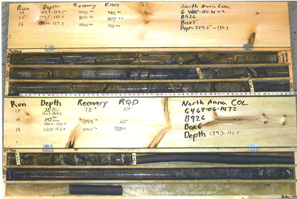
B-926 - Box 5 B-926 - Box 6