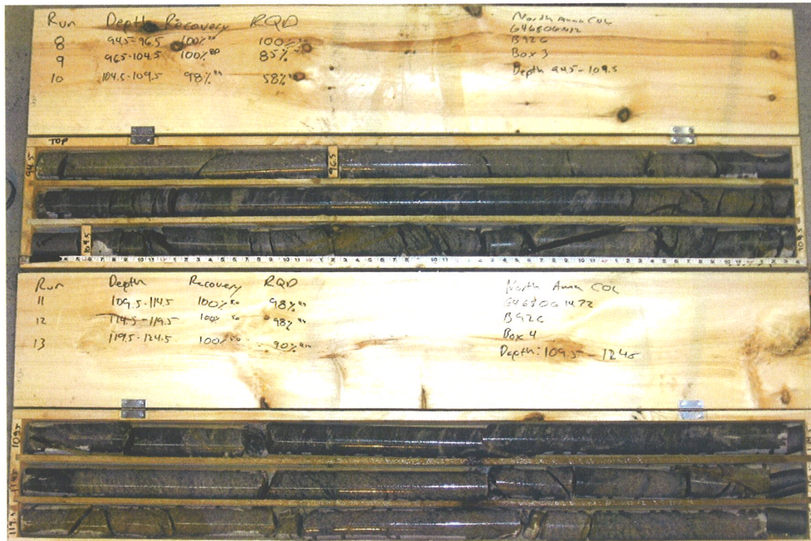
B-926 - Box 3