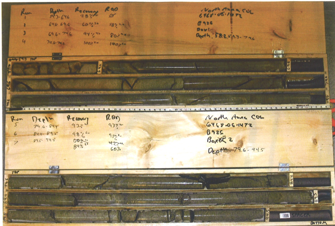
B-926 - Box 1