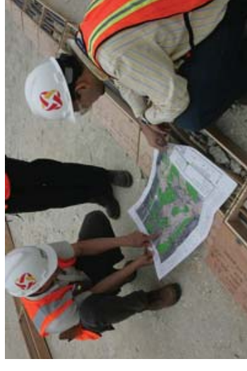
Levy County site inspection

NRC implements programs and procedures to systematically assess and coordinate the follow-up of all new reactor construction-related issues. NRC monitors and evaluates lessons learned from industry activities, both foreign and domestic.