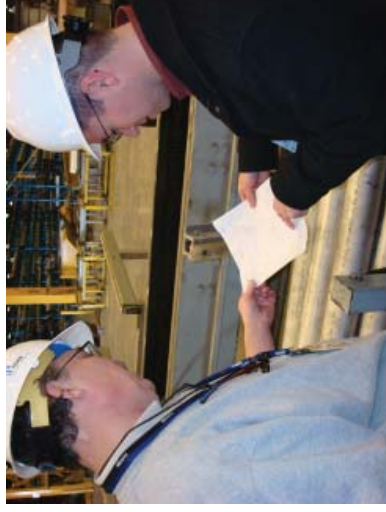
Trioga Pipe Vendor Inspection

The NRC's Center for Construction Inspection, located in Atlanta, will take the lead in implementing the Construction Inspection Program to oversee construction activities in the United States.