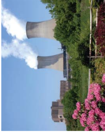
Limerick Nuclear Power Plant

The Nuclear Regulatory Commission (NRC) is an independent Federal agency responsible for regulating non-military uses of nuclear technology. The NRC was created by the Energy Reorganization Act, signed into law in 1974.