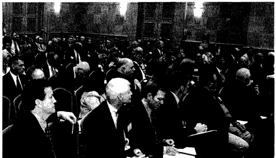
The workshop attracted many participants.

Many workshop participants agreed there are specific issues to be resolved with any replacement technology and that big differences exist between x-ray and gamma radiation in terms of absorbed dose. While there may be alternatives to certain types of processes, these alternatives may not be suitable for other