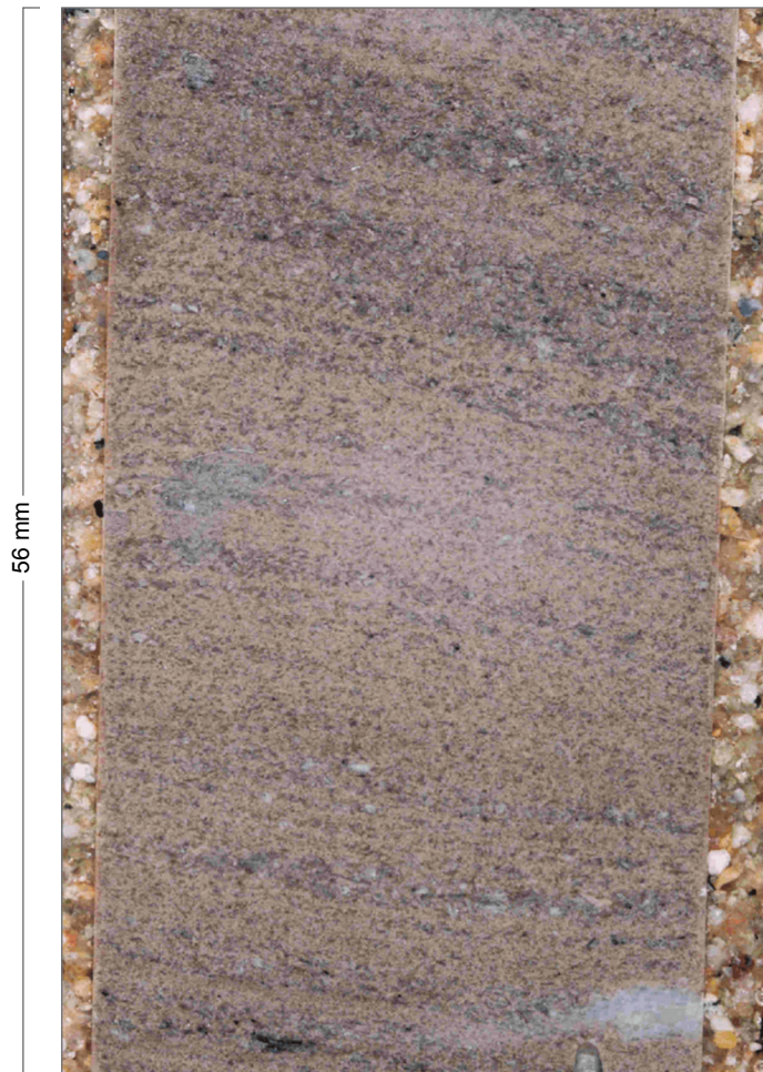
BLN-17 Pelloidal limestone with sedimentary laminations