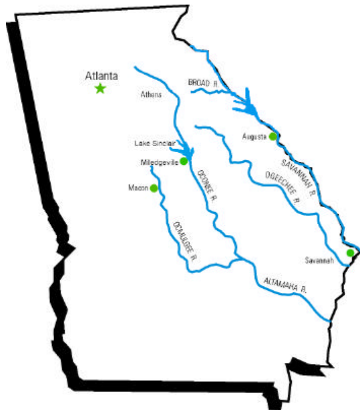
Figure 1. State of Georgia showing the location of GPC's Sinclair Hydroelectric Project and major rivers within the Georgia portion of the historic range for the robust redhorse.

During the early stages of FERC relicensing in 1991, a rare fish was "rediscovered" in the Oconee River downstream of the Sinclair Project. The fish was eventually identified as the robust redhorse Moxostoma robustum by several ichthyologists.