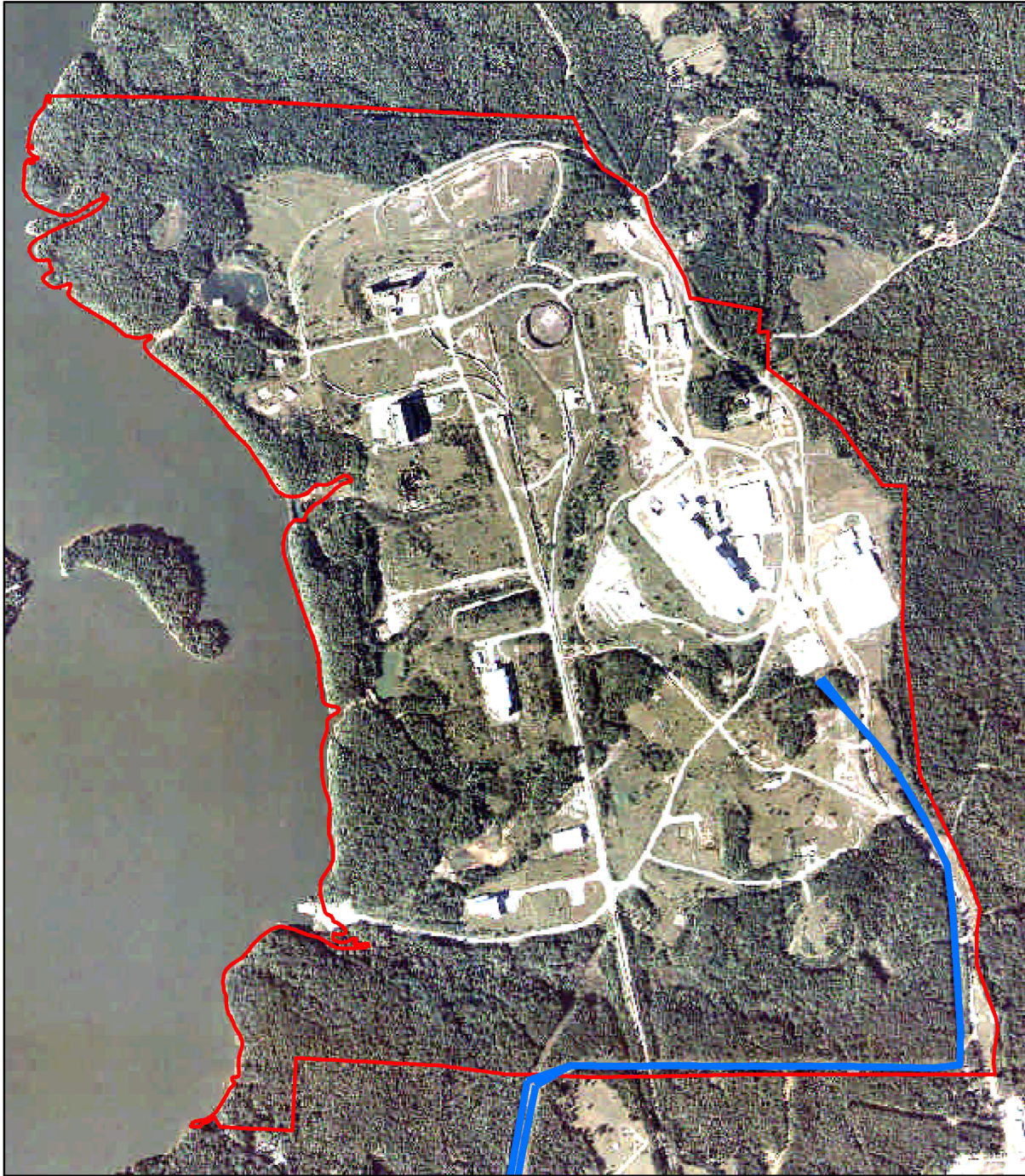
Yellow Creek Site