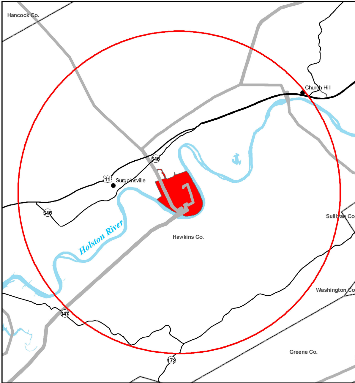
Phipps Bend Site 6-Mile Vicinity