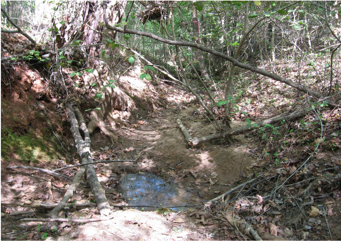
Unnamed Mayo Creek tributary stream sampled in April 2007, showing dry streambed.

The fish community structure of Mayo Creek bears a striking resemblance to those of other small Piedmont streams in Georgia and South Carolina. Yellowfin shiners (35.7 percent of total) and bluehead chubs (24.3 percent of total) dominated collections from four of five habitat types in Moore Creek, a third-order lower Piedmont stream in central Georgia (Parmley and Gaddis 2001). Cyprinids comprised 70 percent of all fish collected from Moore Creek. Three Cyprinids (bluehead chub, yellowfin shiner, creek chub) were numerically dominant in samples from two (Newberry County) South Carolina Piedmont streams in both dry (2000) and wet years (2003), but creek chubs were relatively more abundant in the wet (“post-drought”) year (Keaton et al. 2005). Keaton et al. hypothesized that turbidity associated with higher rainfall and higher streamflows in 2003 drove bluehead chubs and yellowfin shiners upstream into less-turbid tributaries. They also hypothesized that deeper water created conditions more favorable to the creek chub, a large (up to 12 inches long), “aggressive,” omnivorous minnow species that can feed on smaller minnows.