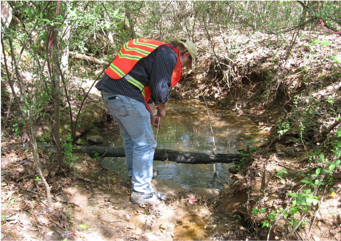
Biologist retrieves minnow trap at Station MC-5.