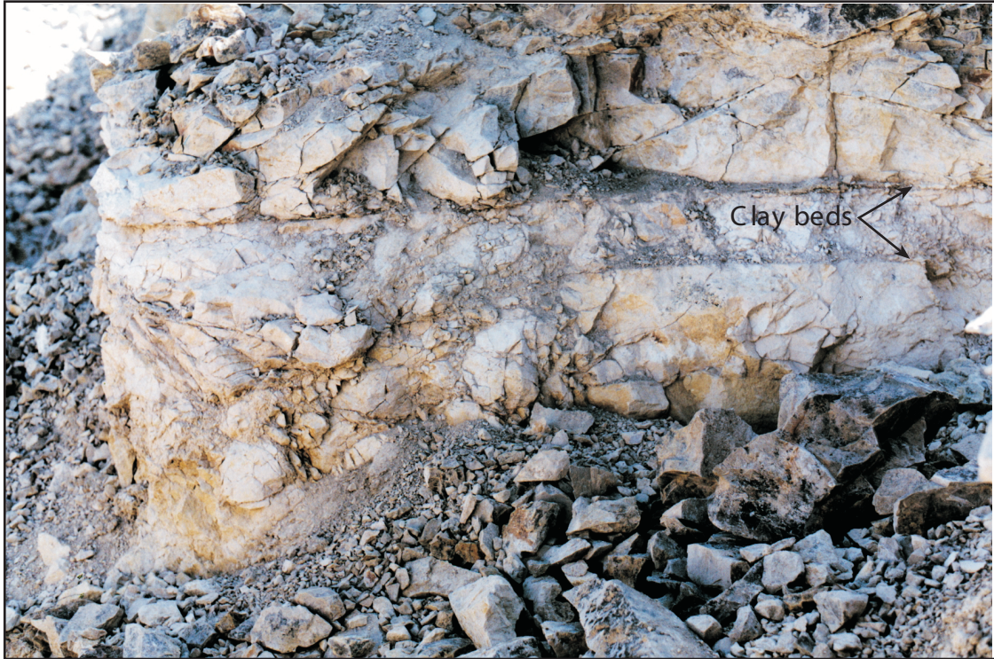
Typical dolomite Tof b-1 and thin clay beds exposed in trench T-11C. Clay beds are subhorizontal and define bedding. Photo roll 01JLB-1.