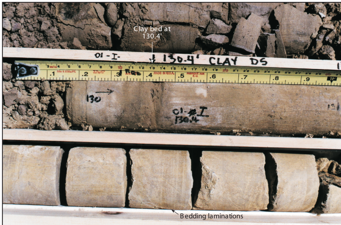
Typical appearance of clay bed and bedding laminations in a section of core at 130 feet from boring 01-I, south of the ISFSI. Clay bed occurs within Tof_{b-1} . Photo roll 01JL B-ba.