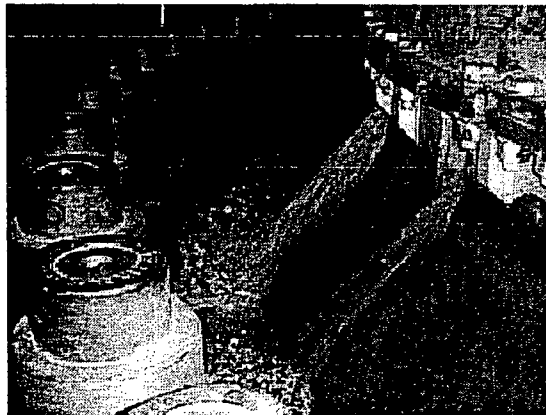
Red Rusty Boric Acid Deposits on Vessel Flange (12RFO)