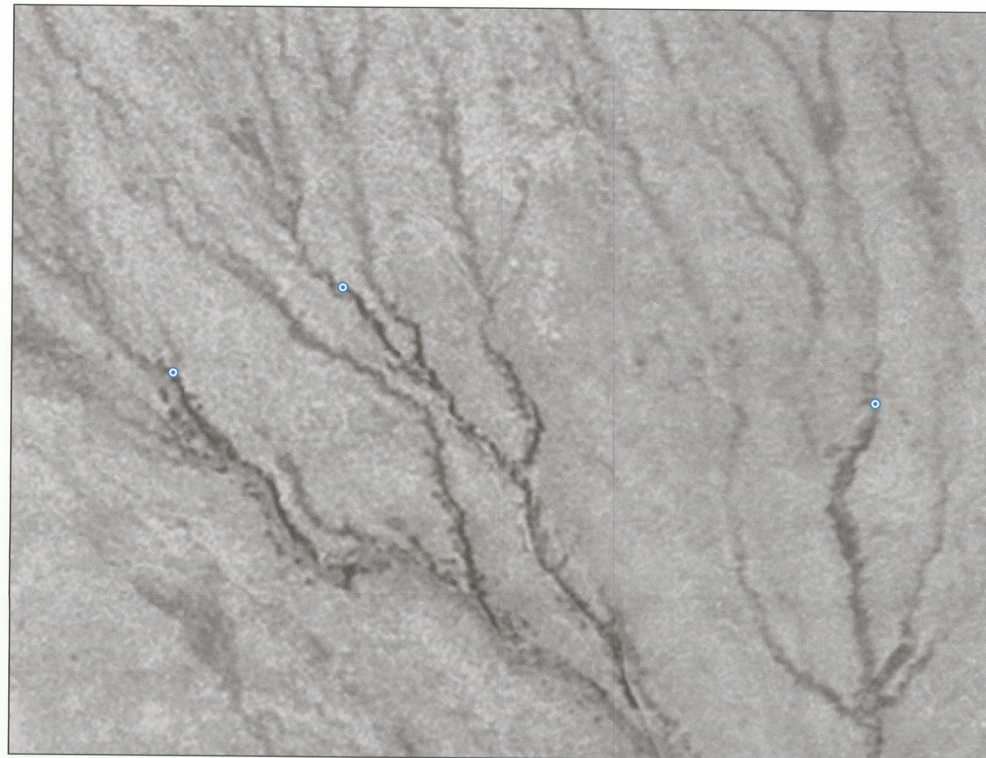
1974 AERIAL PHOTOGRAPH