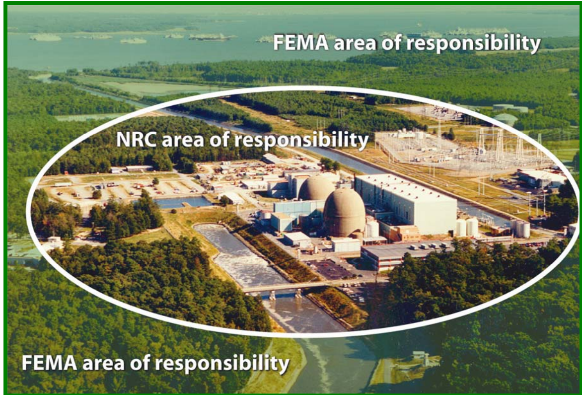
Figure 2: NRC regulates the emergency planning activities within the physical boundaries of nuclear power plant facility perimeters.

During biennial full-participation EP exercises, NRC evaluates licensees implementation of their emergency plans, while FEMA assesses State and local authorities' abilities to carry out offsite emergency plans.