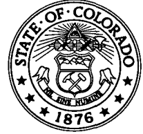
Bill Ritter, Jr. Governor

136 State Capitol Building Denver, Colorado 80203 (303) 866 - 2471 (303) 866 - 2003 fax