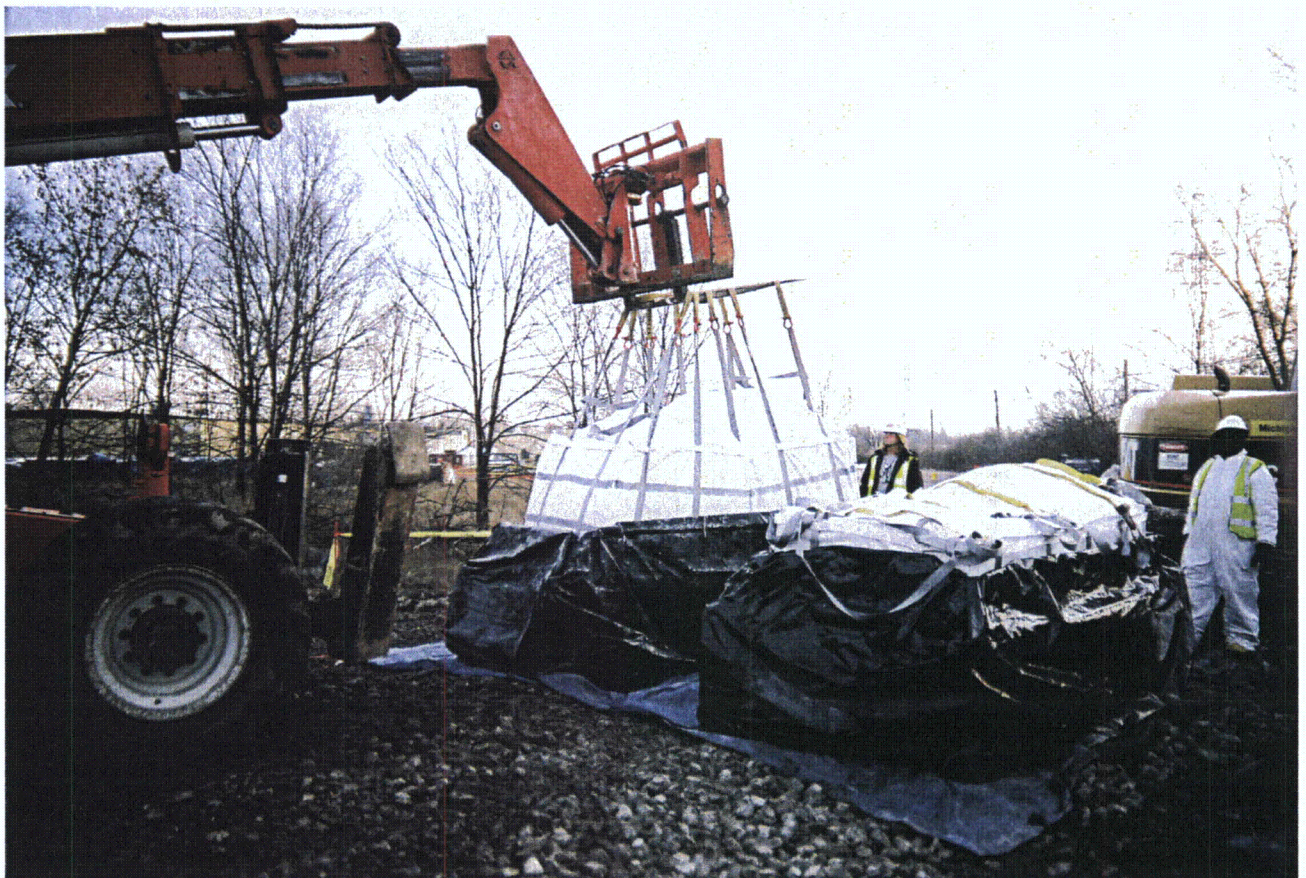
Photo 12 - Super sacks containing excavated material.