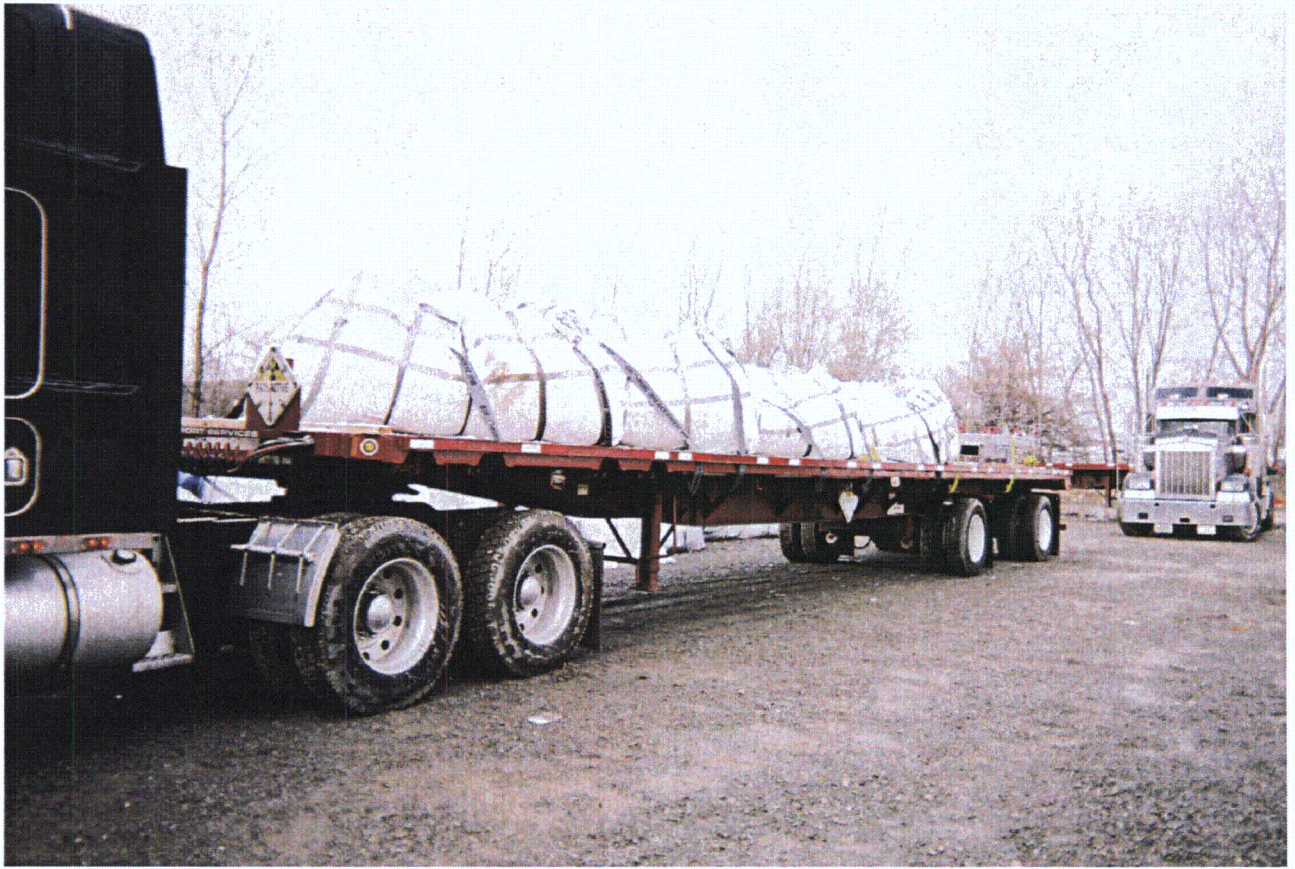
Photo 13 - Super sacks loaded for transportation to rail yard.