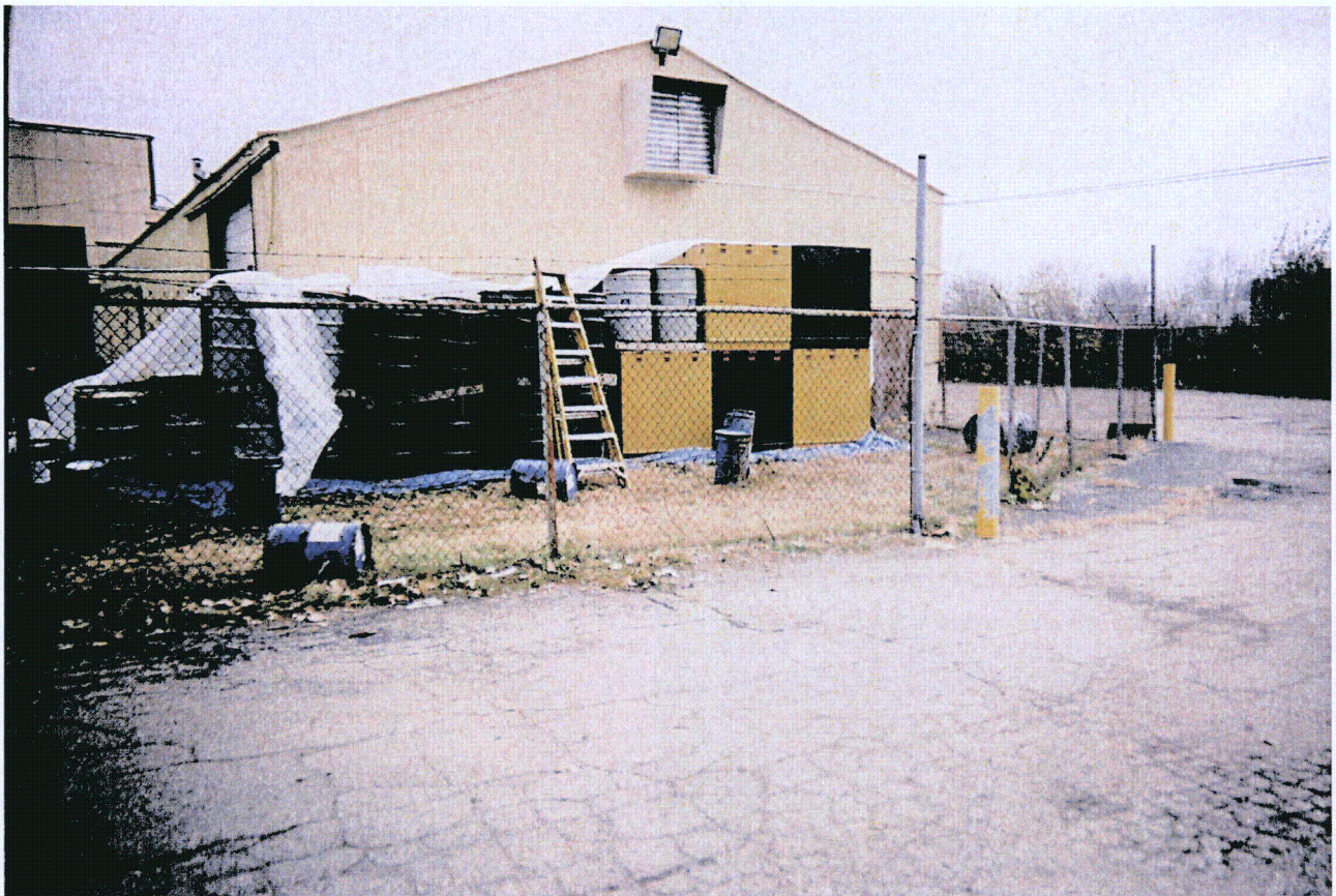
Photo 8 - Drum storage area.