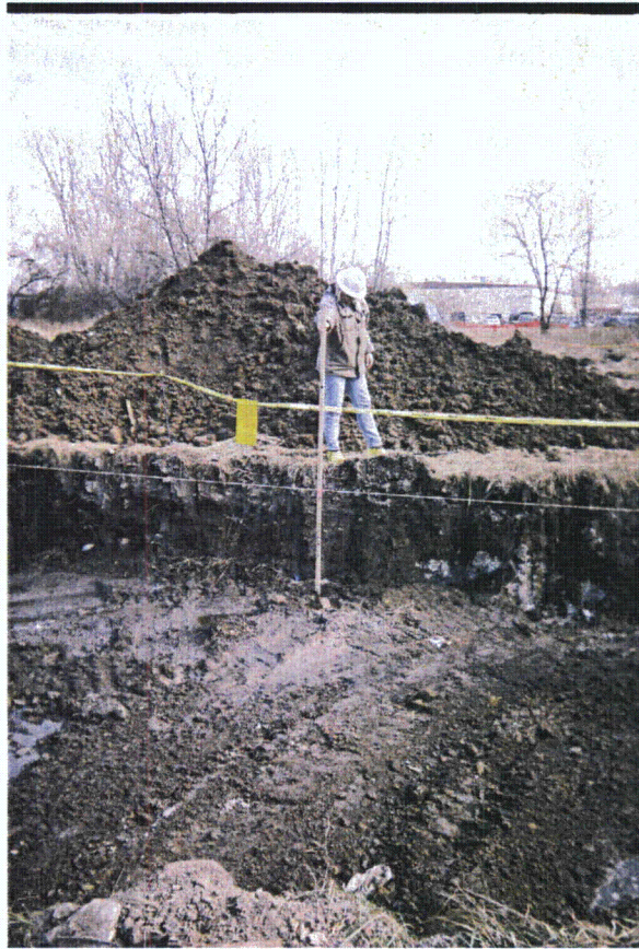
Photo 5 - Measuring depth of excavated grid.