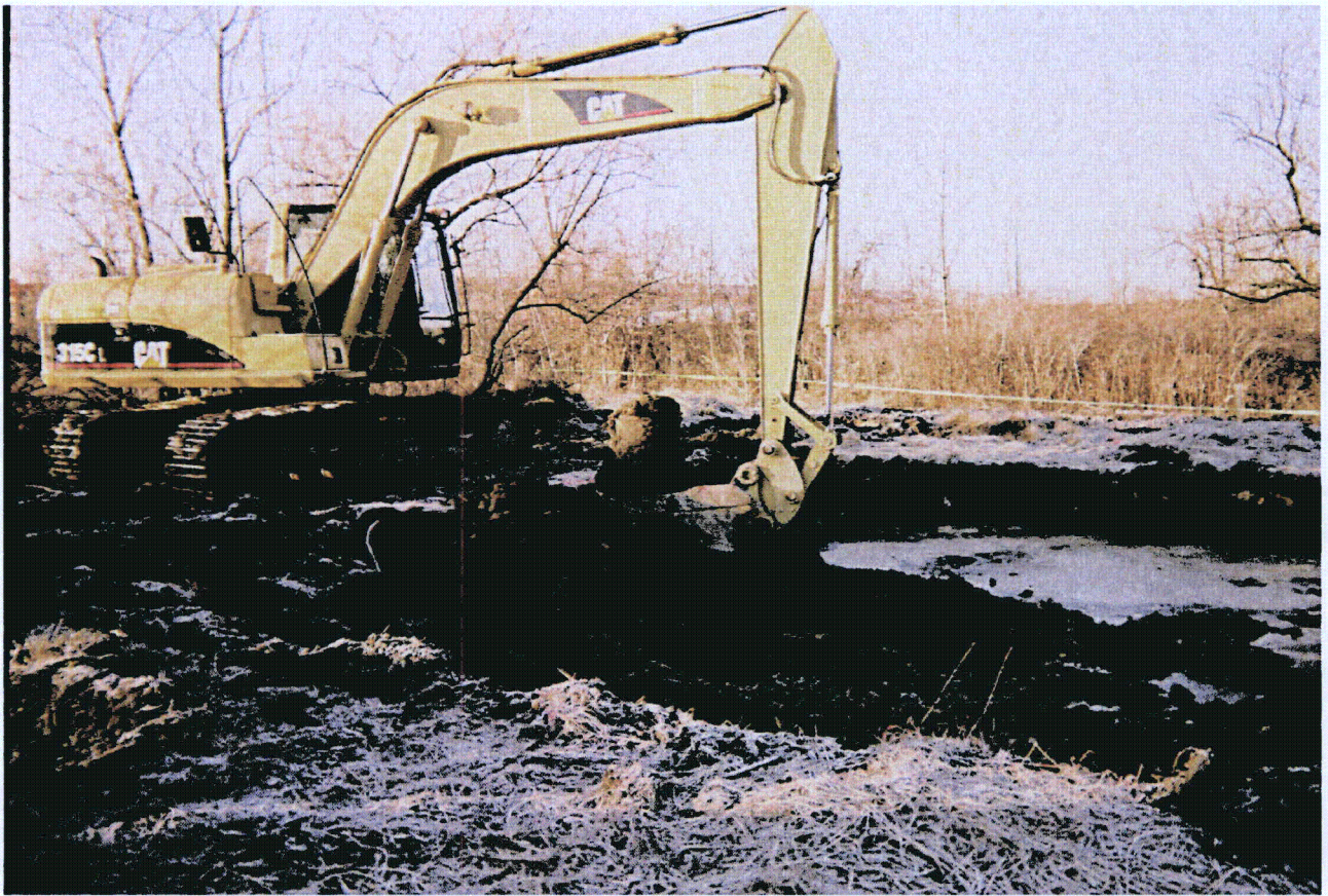
Photo 1 - Soil excavating activities.