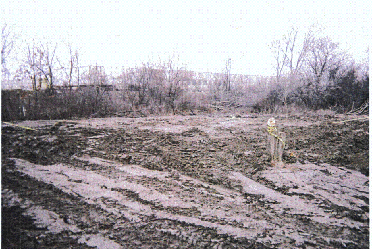
Photo 11 - Grids after being backfilled.