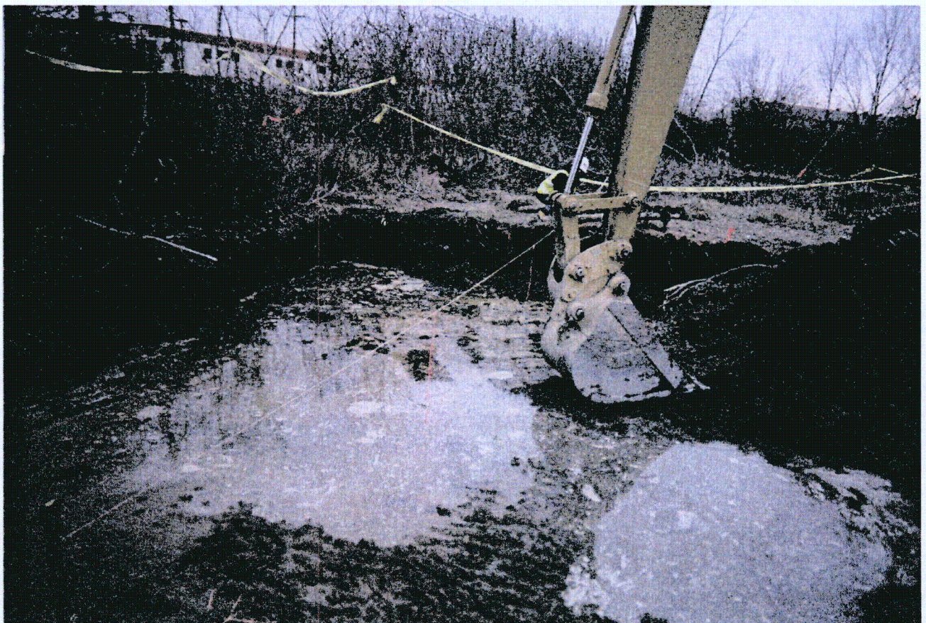
Photo 2 - Soil excavation activities.