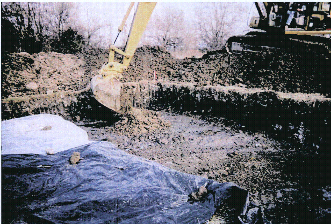
Photo 10 - Backfilling of excavated grids with clean fill.