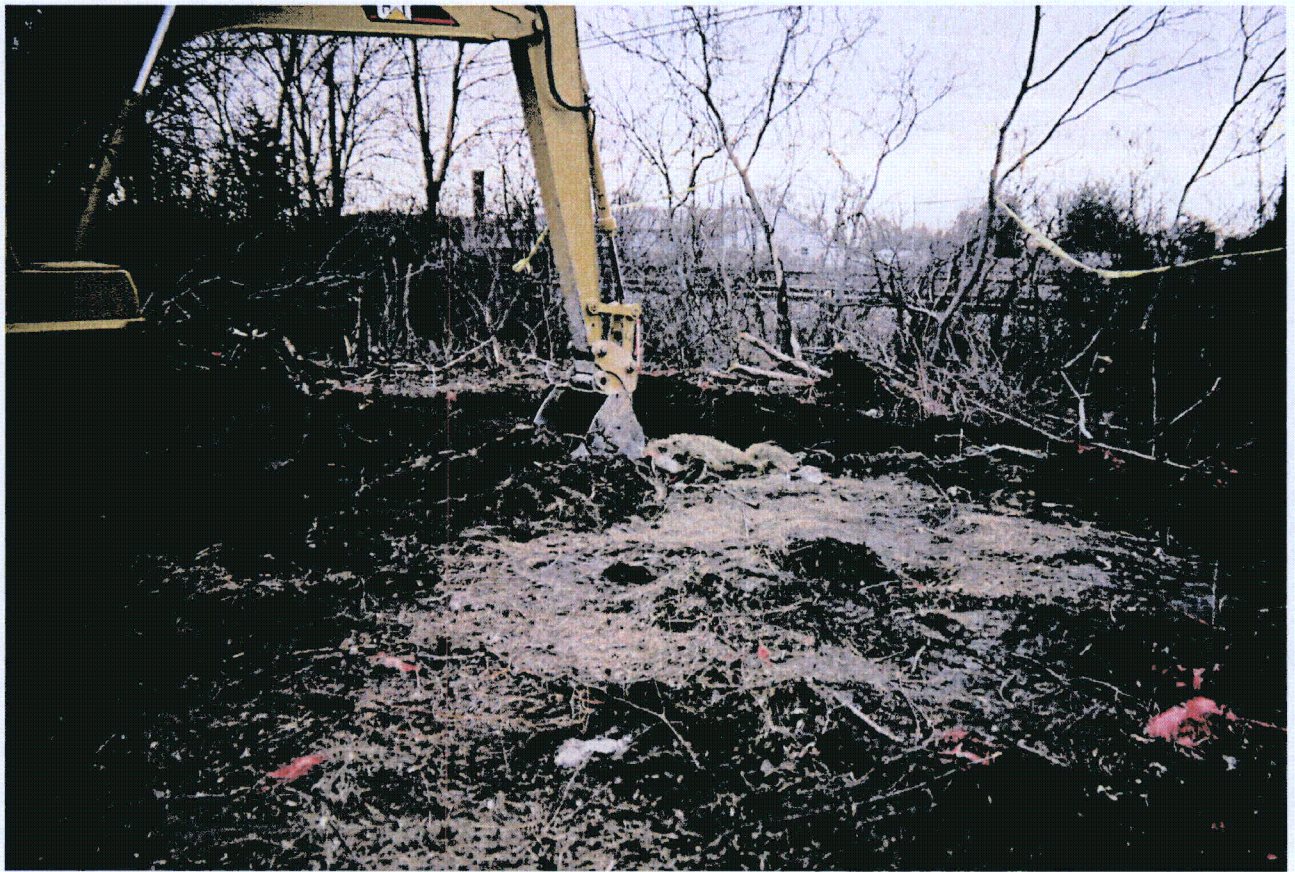
Photo 3 - Soil excavation activities.