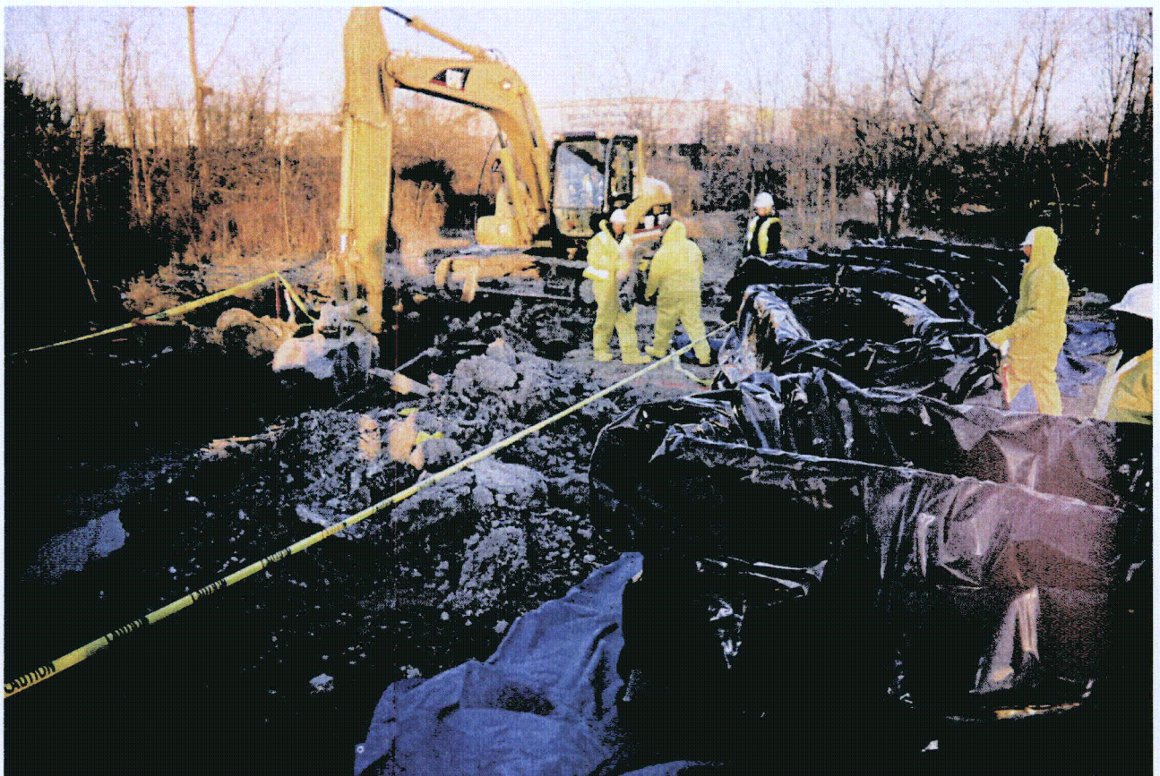
Photo 4 - Soil excavation activities.