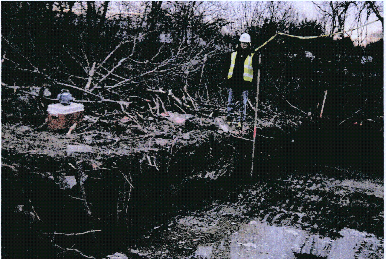
Photo 7 - Measuring depth of excavated grid.