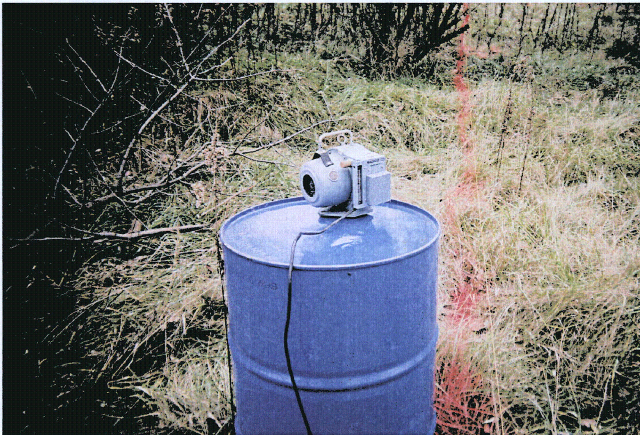
Photo 9 - Air monitor.