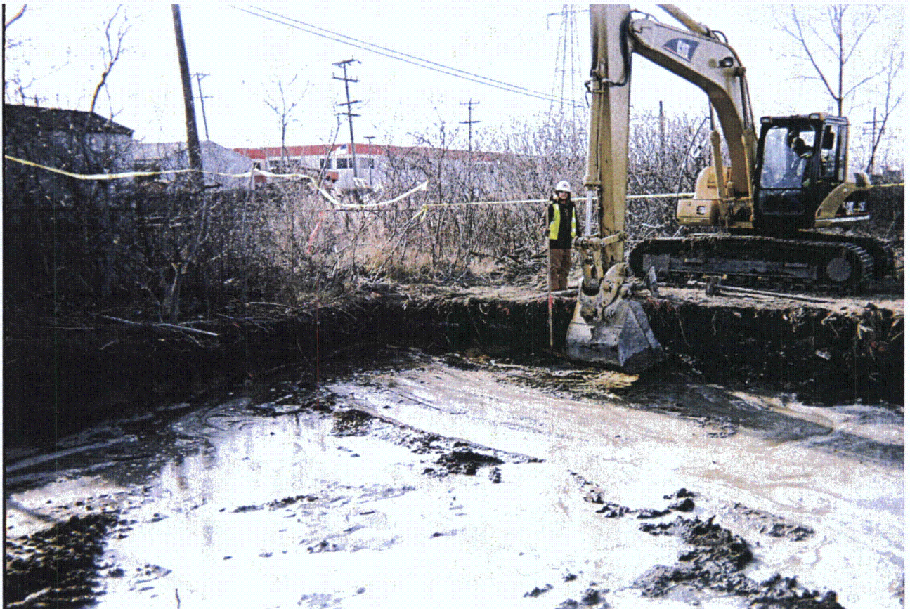
Photo 6 - Measuring depth of excavated grid.