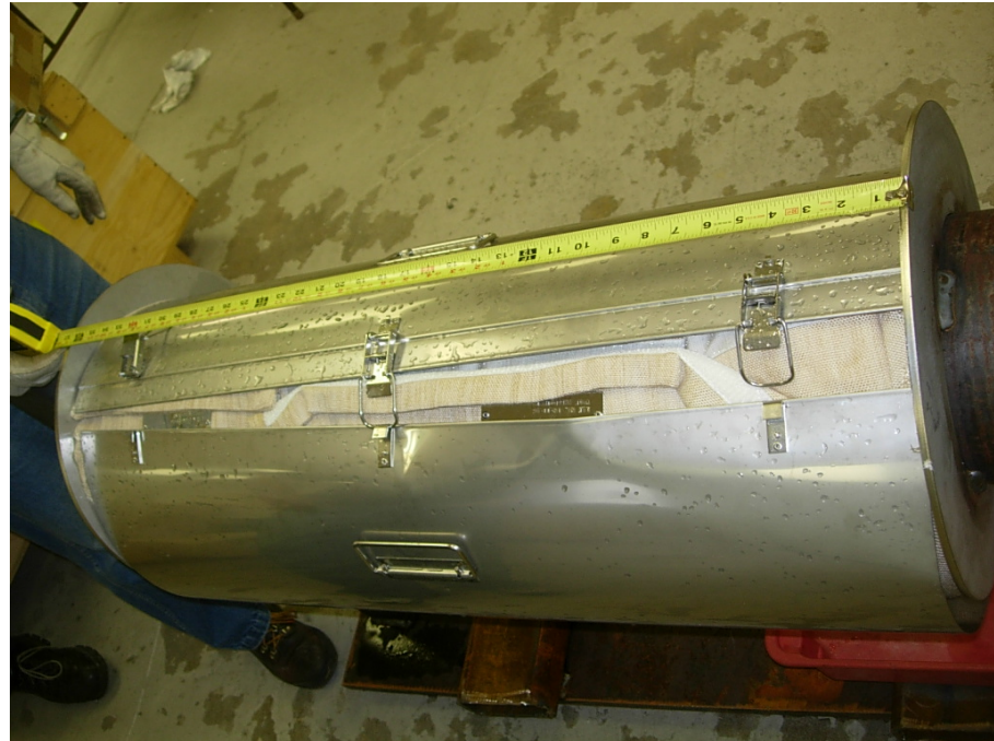
Post-test Photo: No Damage to Jacketed Insulation