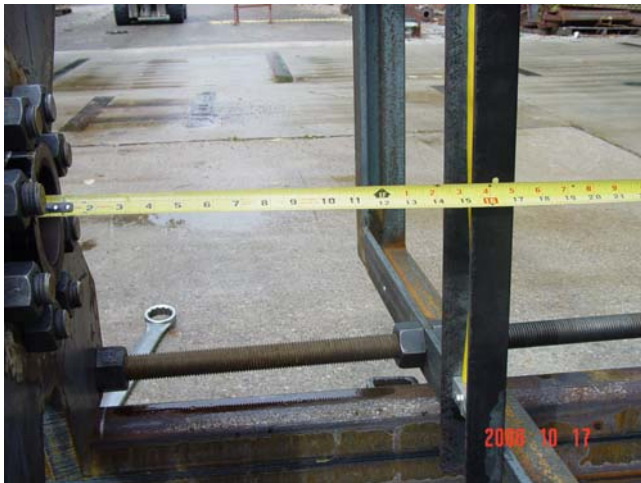
Pre-test Photos of Cables