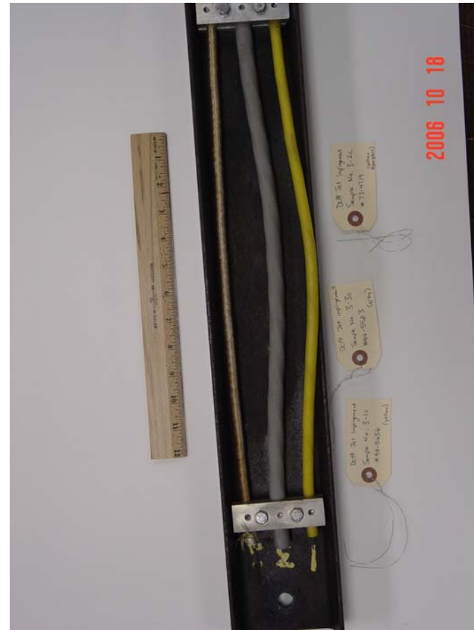
Post-test Photo of Cables