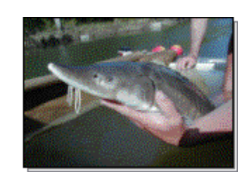
Home • Wildlife Programs • Hunting & Trapping • Fishing • Fisheries Programs • About Us • Buy Your License • Department Library • Education & Training • Support Fish & Wildlife • Wildlife Laws • Press Room • Special Features • Maps • Links • Photo Credit • Site Map • Contact Us

Copyright © 2003-2004 Vermont Fish & Wildlife Department. All Rights Reserved.