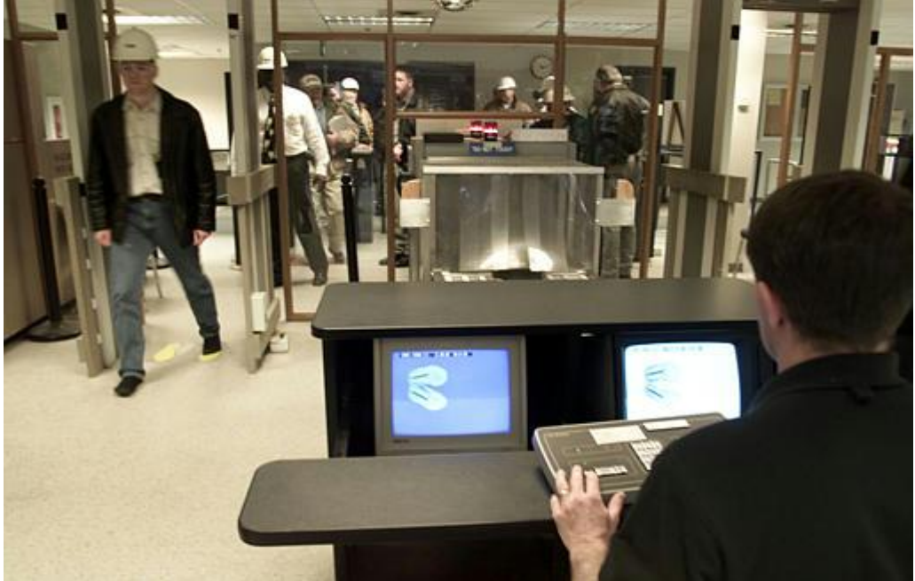
Nuclear power plant security checkpoint

In accordance with the policy for the operating reactor inspection program found in IMC 2515, " Light-Water Reactor Inspection Program – Operations Phase ," Appendix A, the inspection activities and minimum sample sizes must be completed to provide an adequate assessment for each cornerstone under review. IMC 2515 further stipulates that sample sizes specified in the inspection procedures are based on the relative importance of the area covered by the procedure because the underlying concept of the risk-informed inspection program is that it intends to examine samples which have a greater probability of impacting safe and secure plant operations.