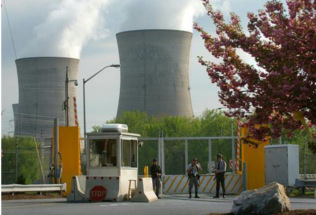
Secured entrance at a nuclear power plant